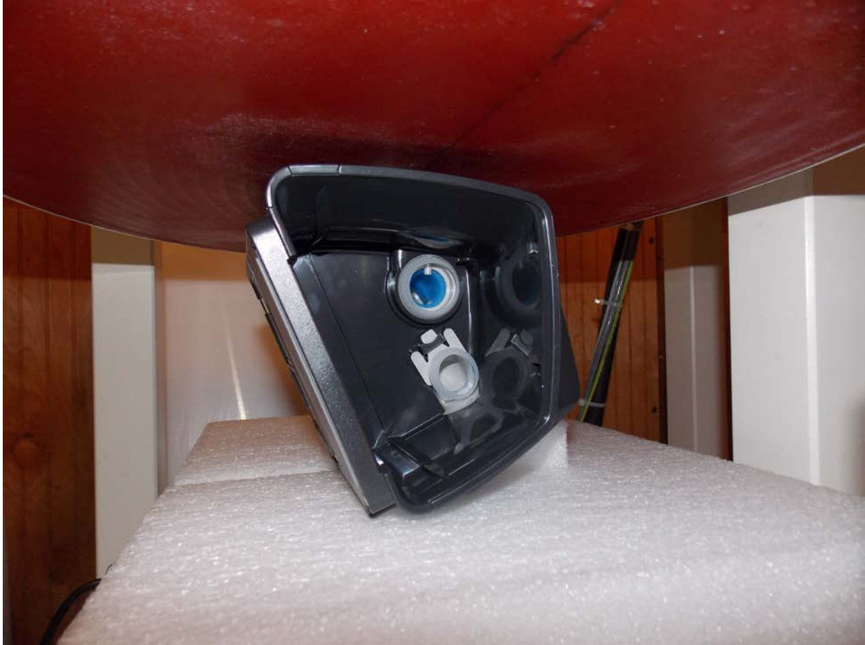
Test Position Front 0 mm Gap