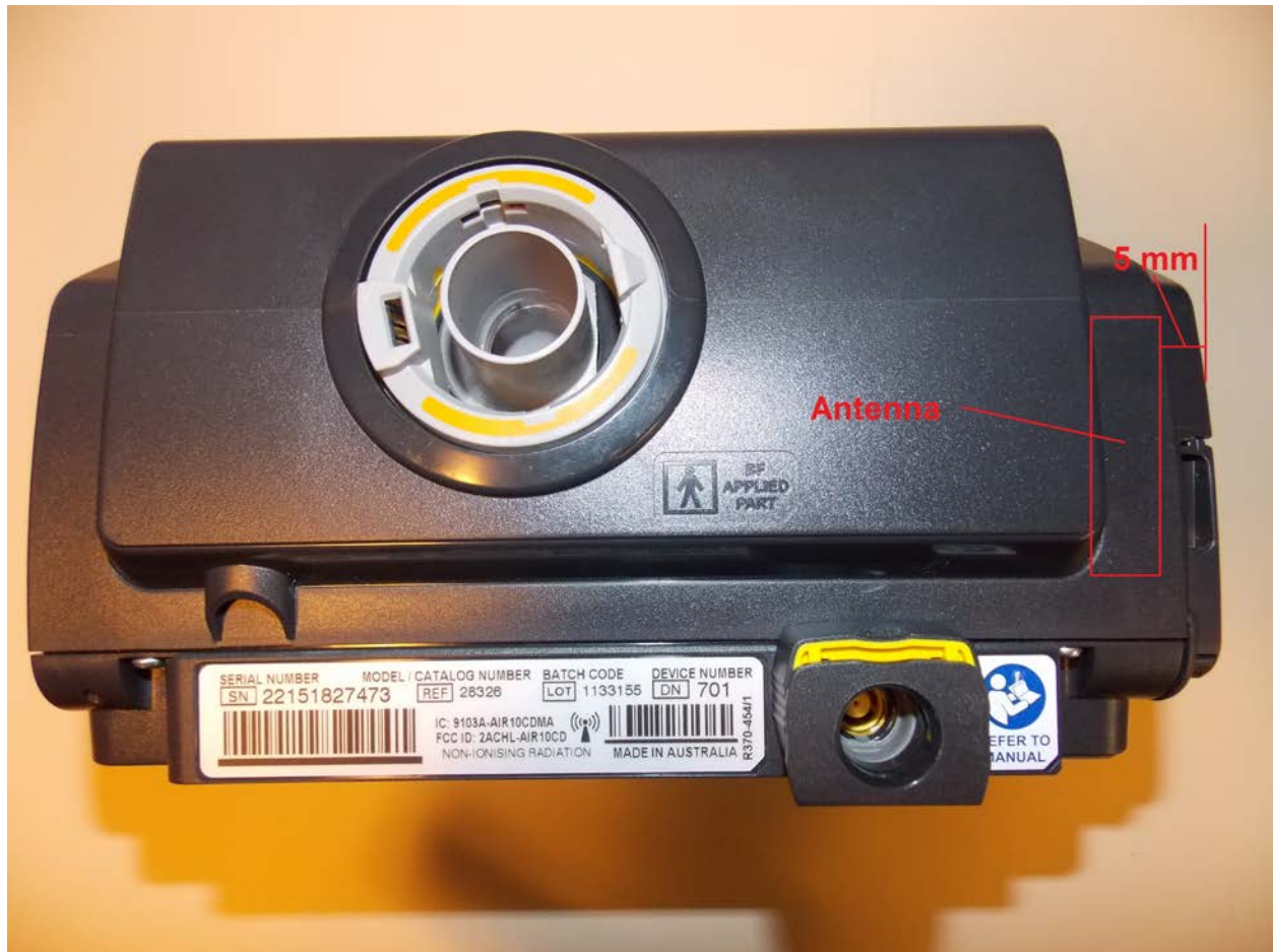
Antenna Location on Back & Distance to End