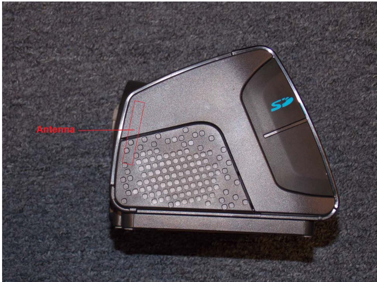
Antenna Location on End