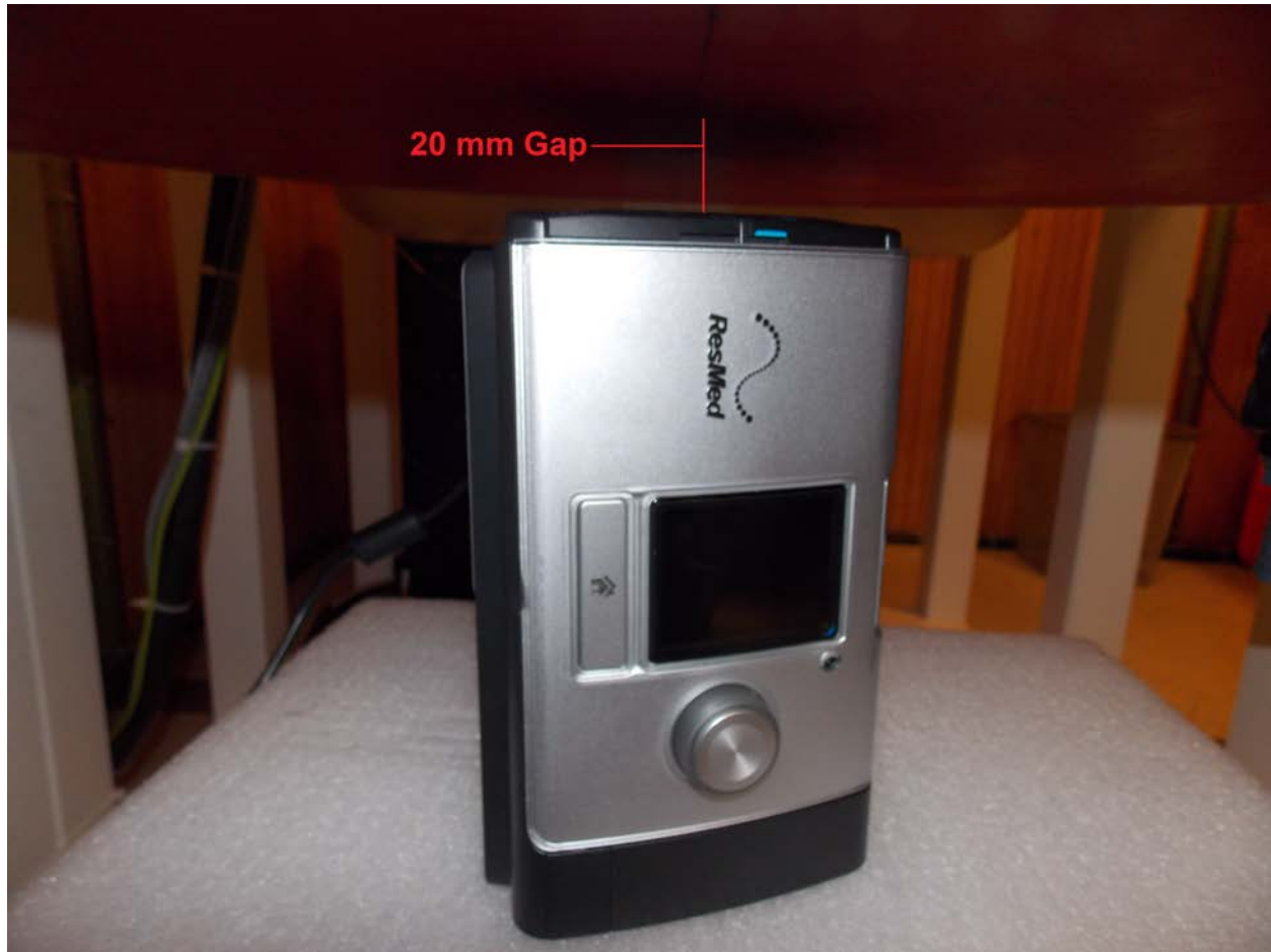
Test Position End 20 mm Gap