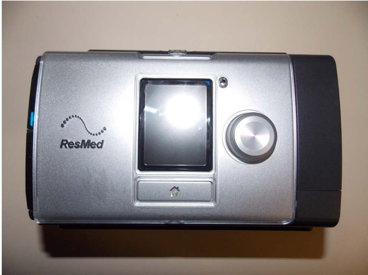
Front of Device