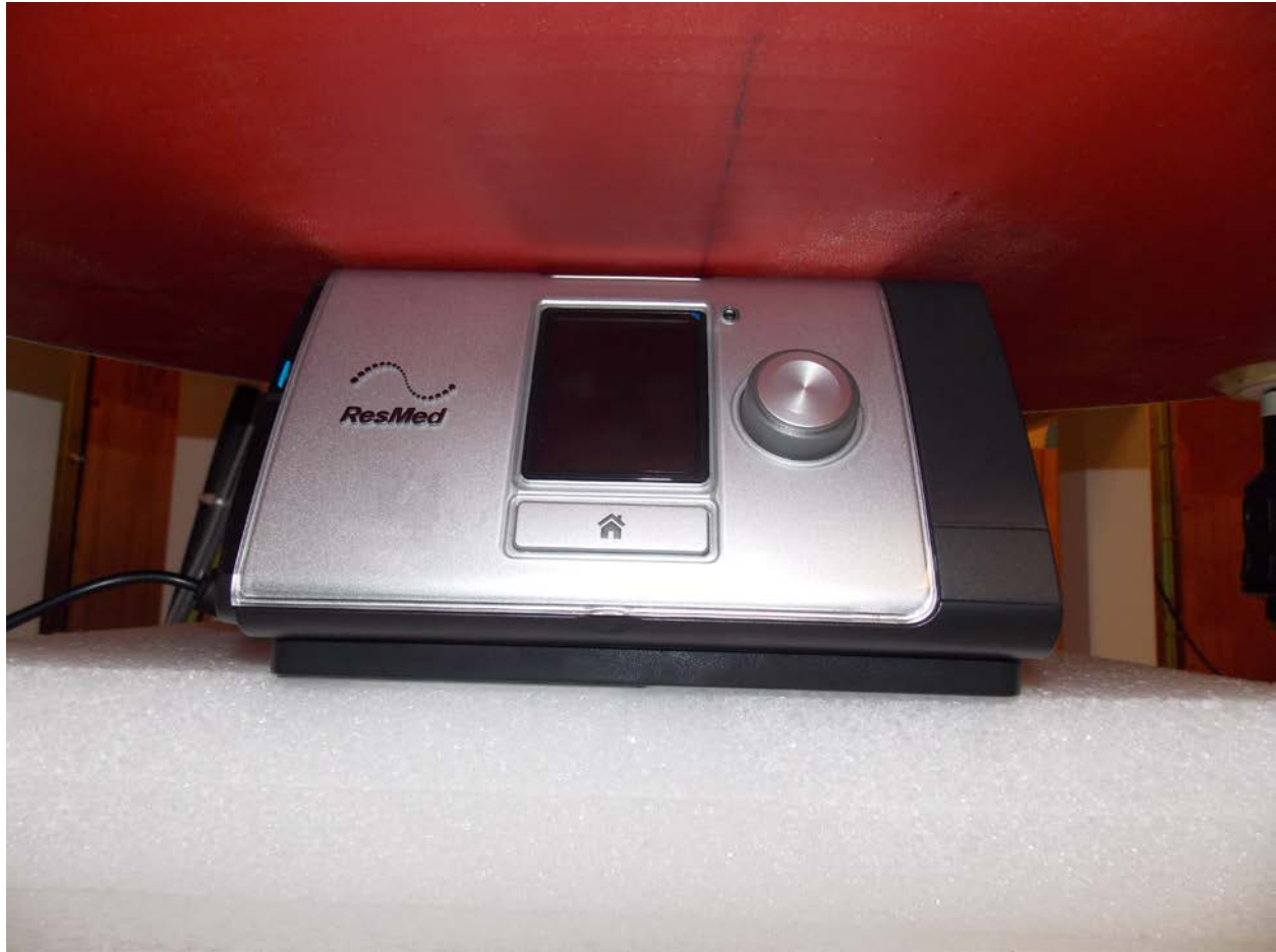
Test Position Top 0 mm Gap