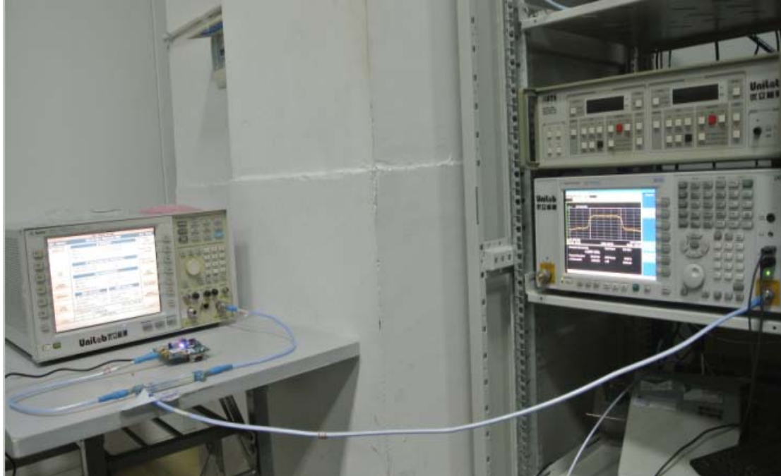
Frequency Stability Under Temperature & Voltage Variations Setup

Occupied Bandwidth, Modulation Characteristic, Conducted Power Measurement, Spurious Emission At Antenna Terminals (+/- 1MHz), Conducted Spurious Emission Measurement Setup