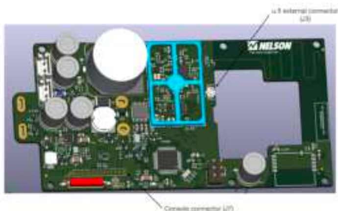
Figure 2. TWIG V UNO Module showing testing access points.

An EMC Test mode is available using firmware number 0xb3e4f3f. This mode is accessed using the connector J7 as shown in Figure 2.