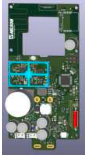
Figure 1. Using Internal Antenna in a Vertical Orientation.

All external antennas used with the TWIG V UNO module should be connected in a manner outlined in chapter 6 of this manual.