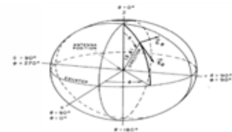
Fig. 2 Standard Spherical Coordinate System Used in Antenna Measurements