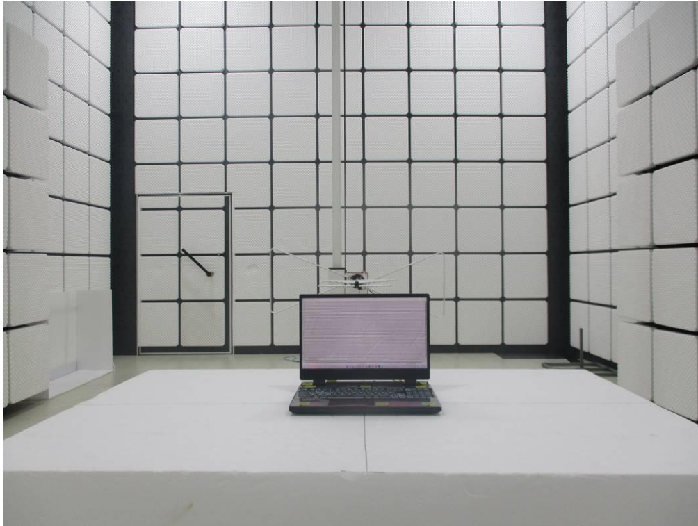
Conducted Setup Photo (Measurement at Antenna Port)