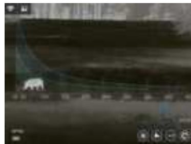
As shown above, the distance of the boar is about 50-100 yards.