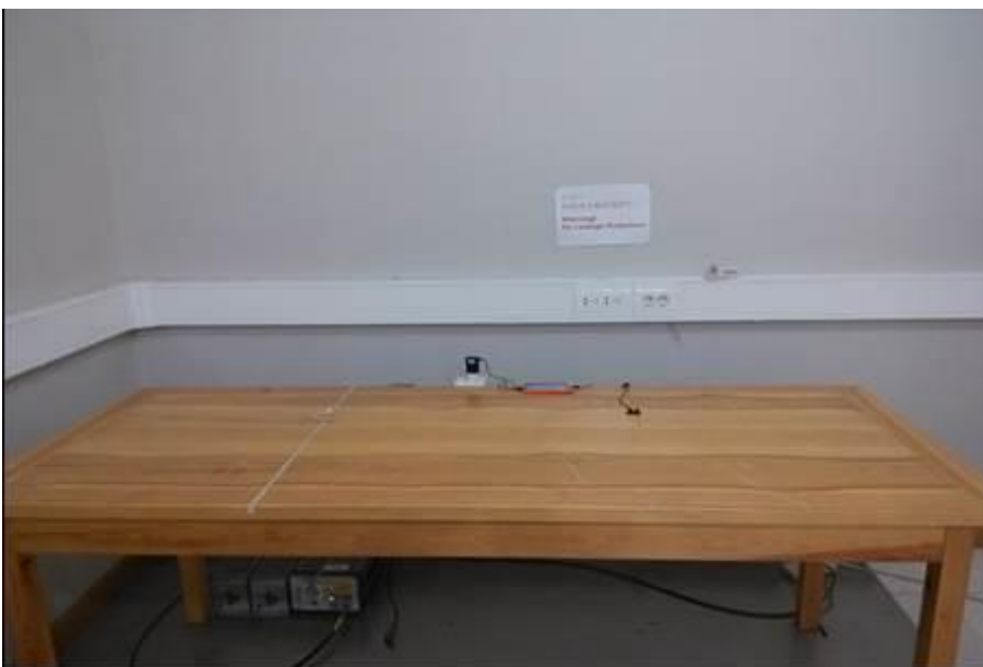
Picture 4. FCC Part 15C AC powerline conducted emissions