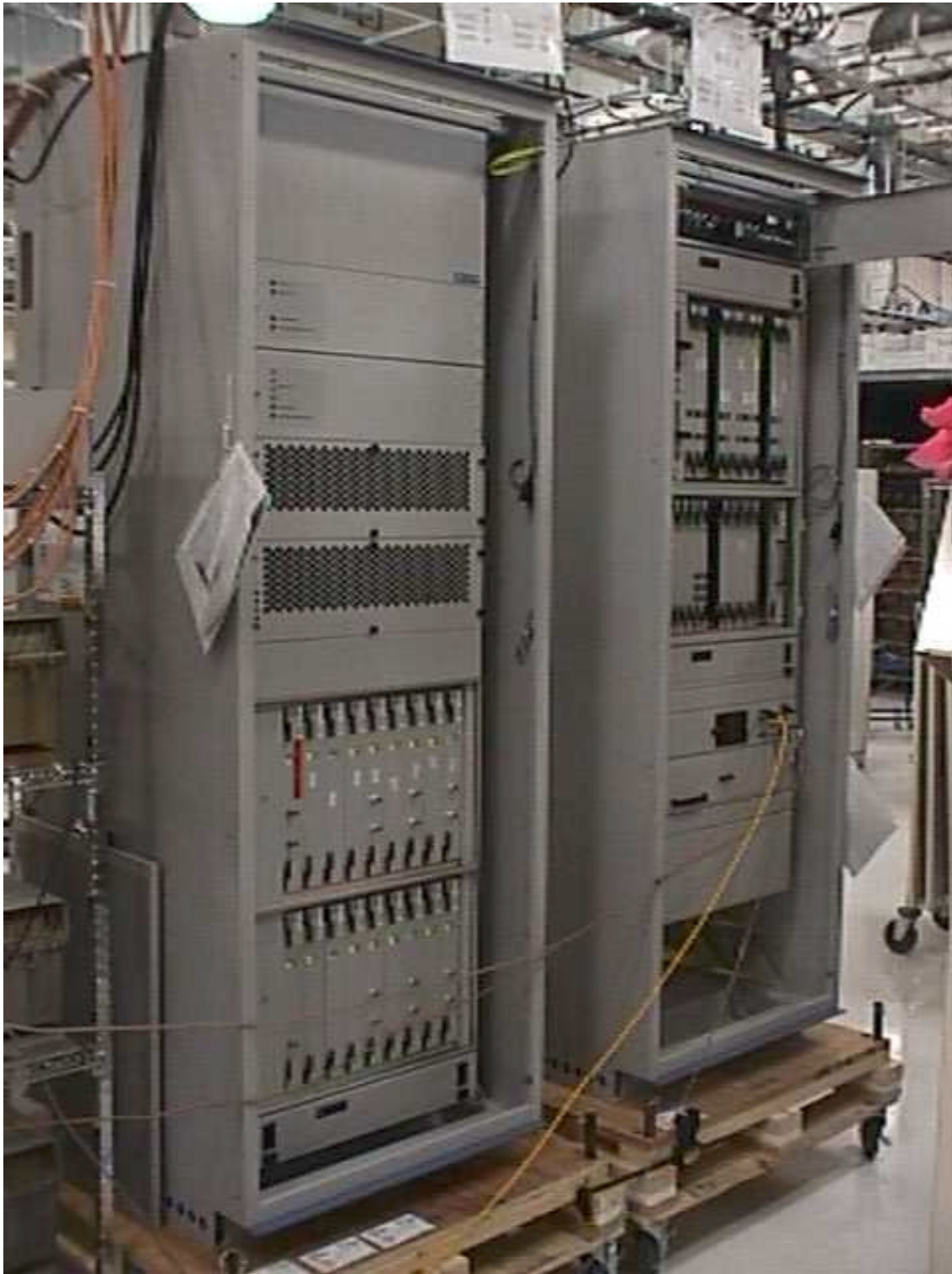
Exhibit 5 Front View, OJYDFK1