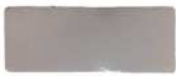
Sponge double-side adhesive tape