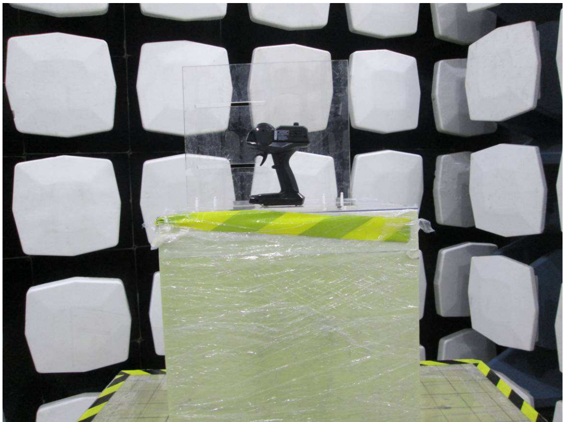
Above 1GHz (The EuT placed at the center of the turntable)