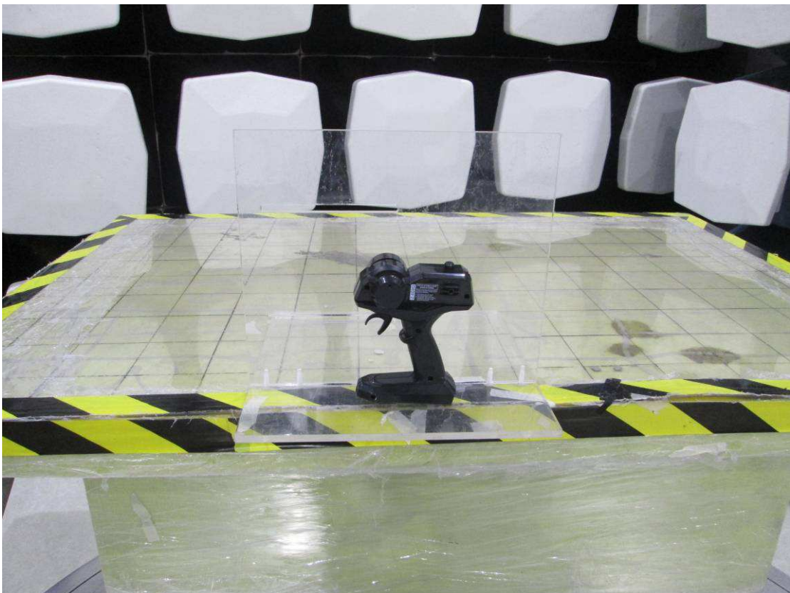
Up to 1GHz (The EuT placed at the center of the turntable)