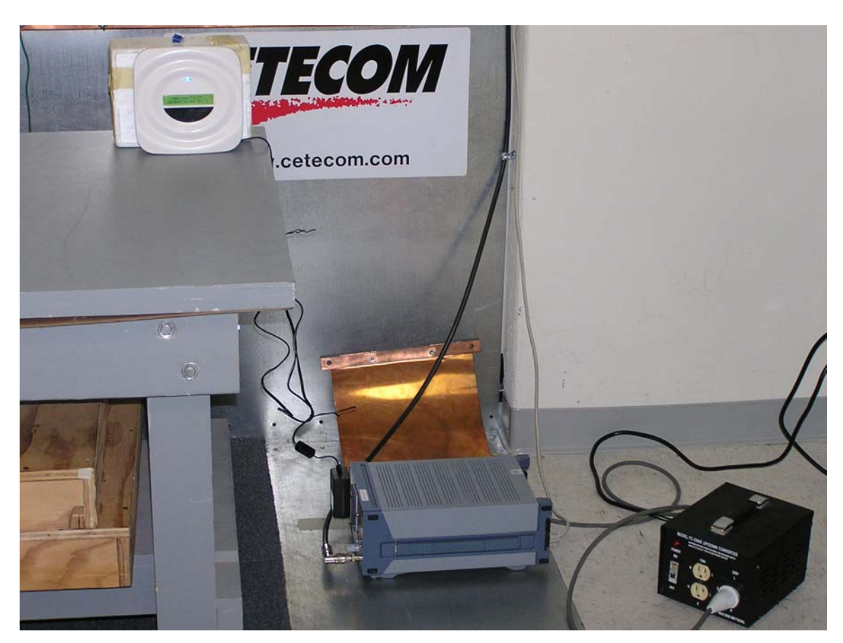
Test setup – AC Line Conducted Emissions