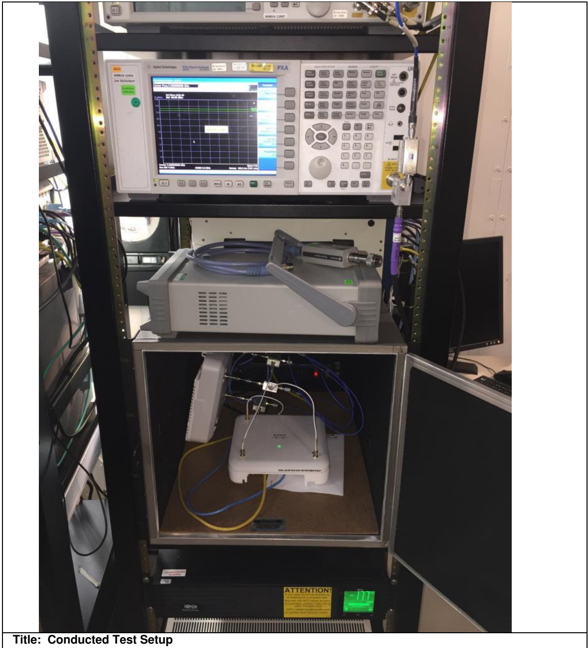
Title: Conducted Test Setup

This is a dual band 2.4GHz / 5GHz device. All ports in this test set up photo are connected as all testing is automated.