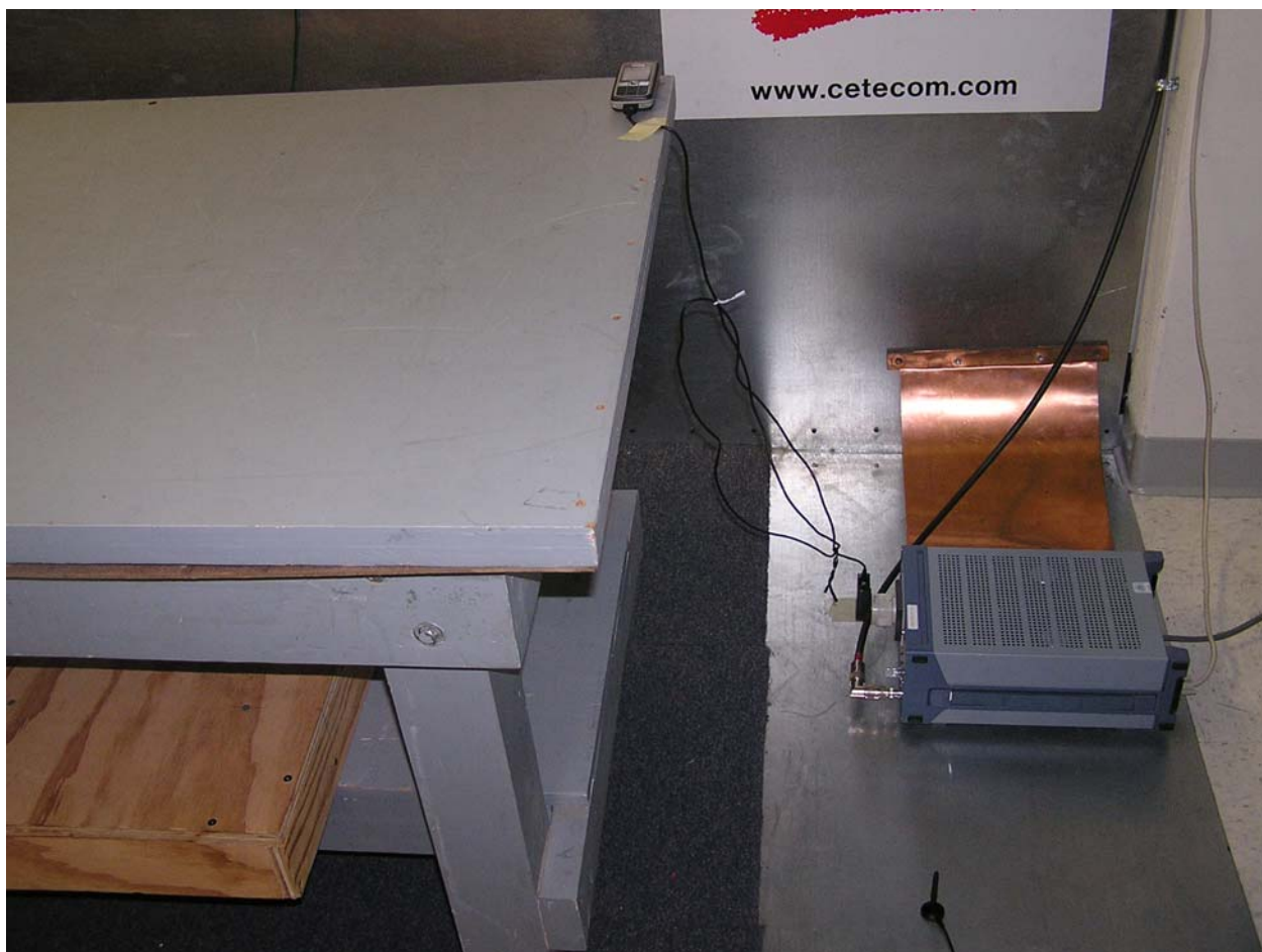
AC LINE CONDUCTION