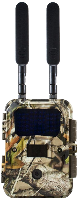
Model: Lookout LTE 4G DUAL Cellular Camera Model

PLEASE READ CAREFULLY BEFORE USING CAMERA