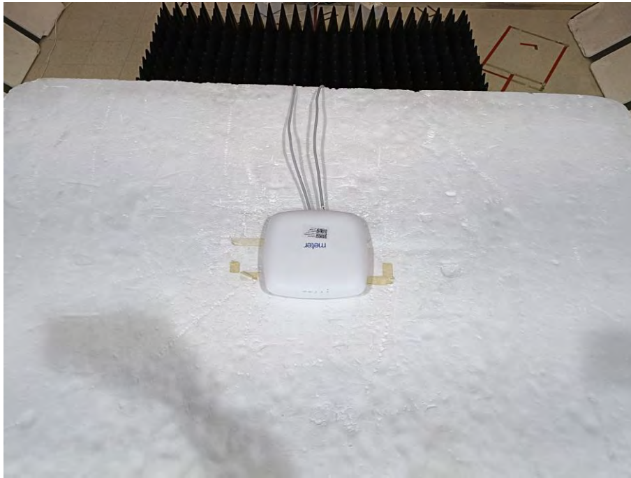
Above 1 GHz _ Rear View