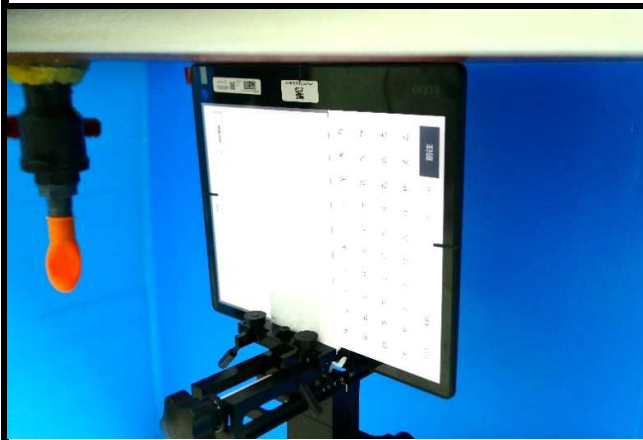
Right Side of EUT Tested at 0 mm