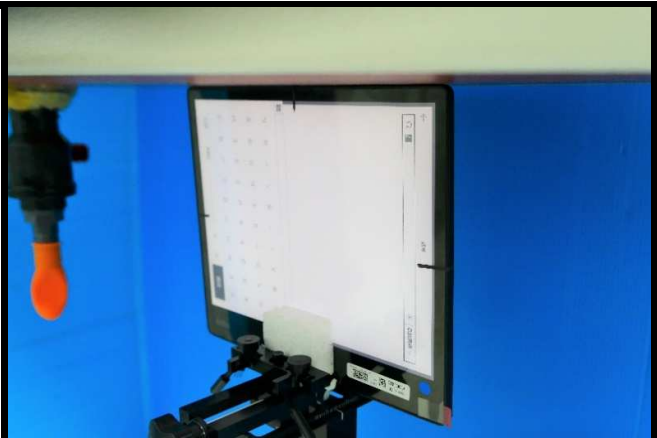
Left Side of EUT Tested at 0 mm