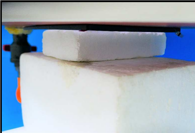
Rear Face of EUT Tested at 0 mm