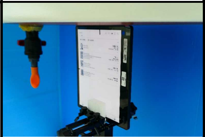
Top Side of EUT Tested at 0 mm