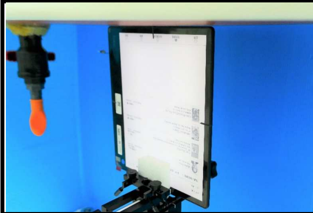
Bottom Side of EUT Tested at 0 mm