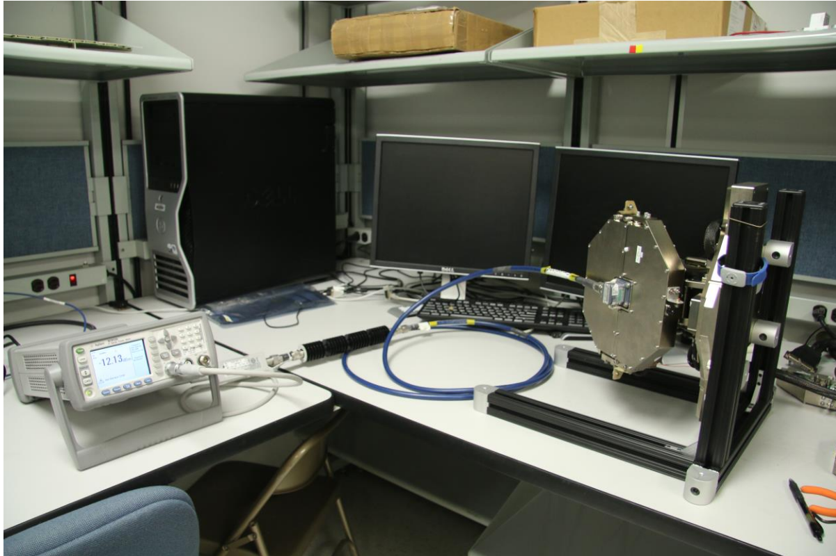
Figure G-2 – RF Power Output Test Equipment Setup, 2, of 2