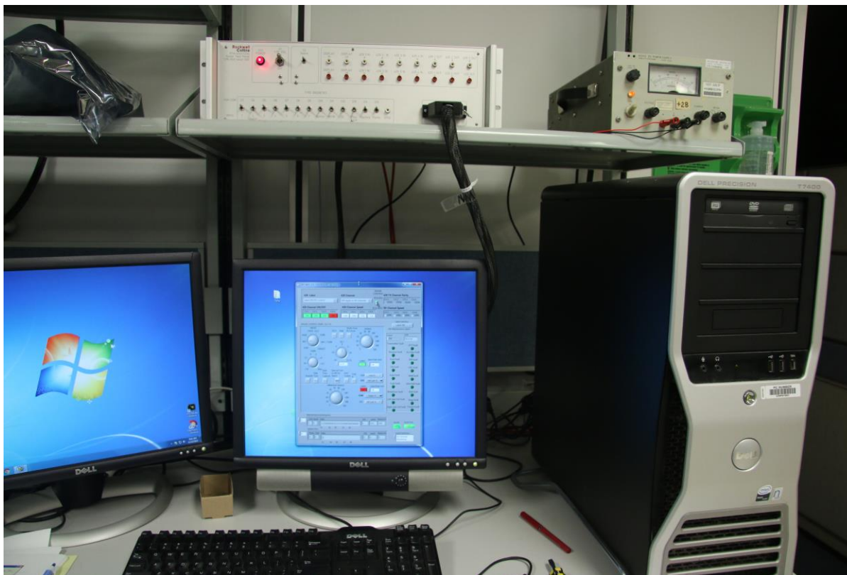
Figure G-3 – Occupied Bandwidth Test Equipment Setup, 1 of 2 – Same as for RF Power Test