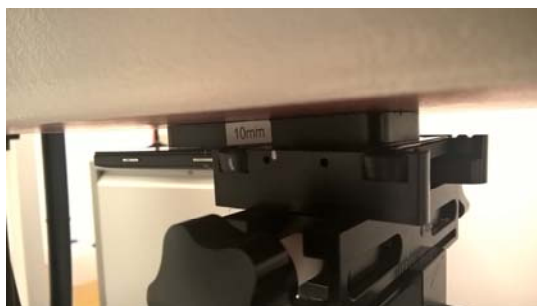
Photo of the device positioned for WR mode measurement – display facing phantom. The spacer was removed before the start of the measurements.