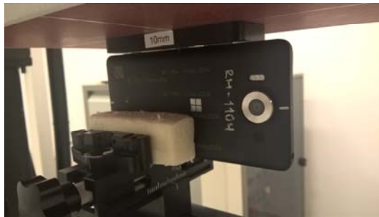
Photo of the device positioned for WR mode measurement – right edge facing phantom. The spacer was removed before the start of the measurements