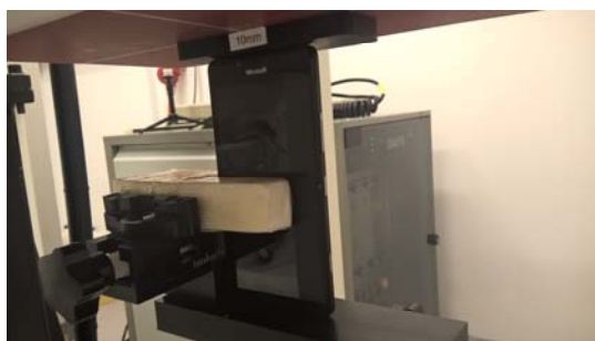
Photo of the device positioned for WR mode measurement – top edge facing phantom. The spacer was removed before the start of the measurements.