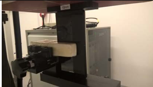
Photo of the device positioned for WR mode measurement – bottom edge facing phantom. The spacer was removed before the start of the measurements.