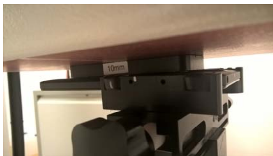
Photo of the device positioned for WR mode measurement –back facing phantom. The spacer was removed before the start of the measurements.

The device was placed in the SPEAG holder using the Microsoft spacer and, in sequence, the back, display and each of the 4 edges was positioned 10 mm away from the flat phantom. The spacer was removed before the start of the measurements.