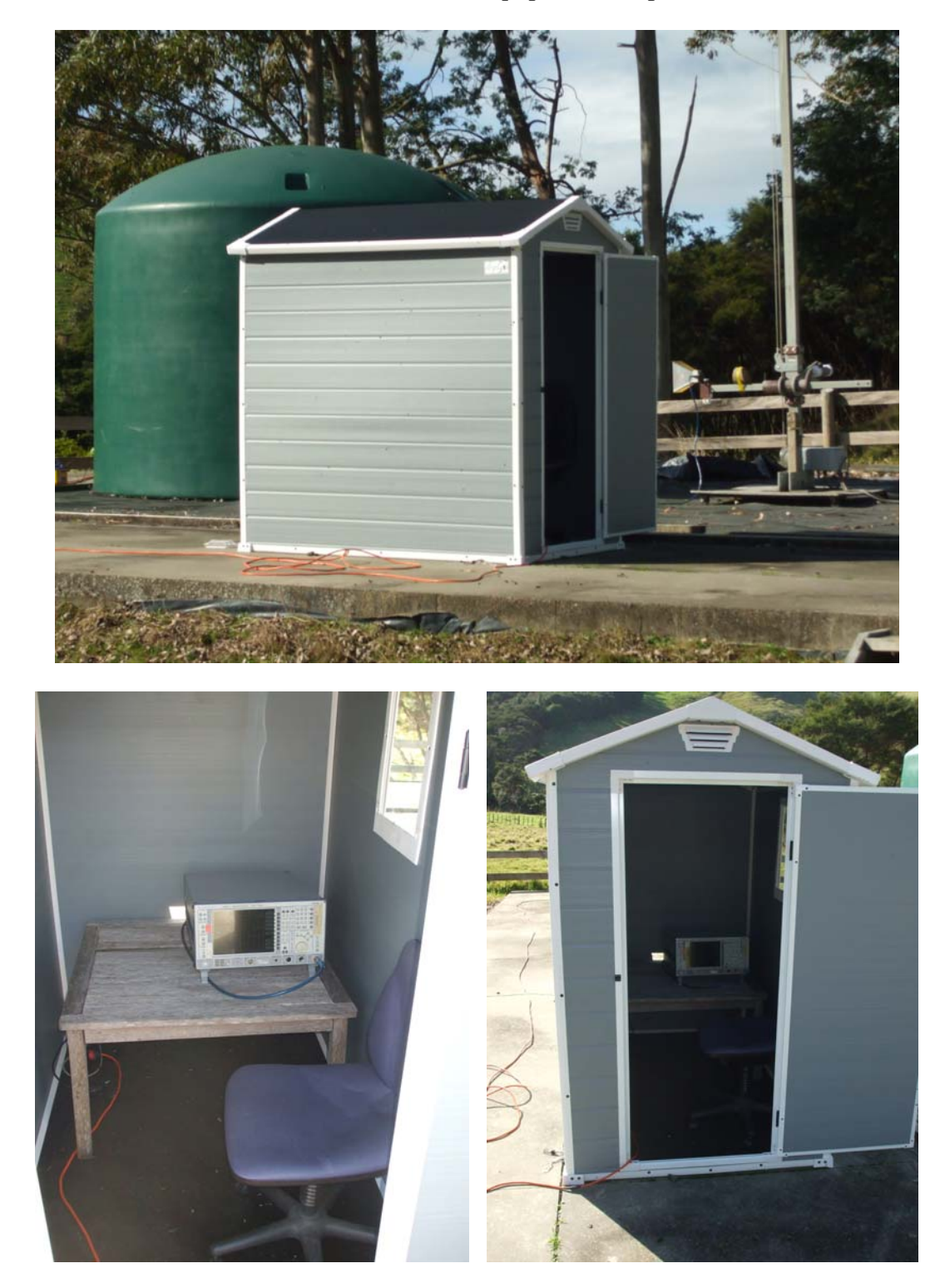
Above 1 GHz test equipment set up