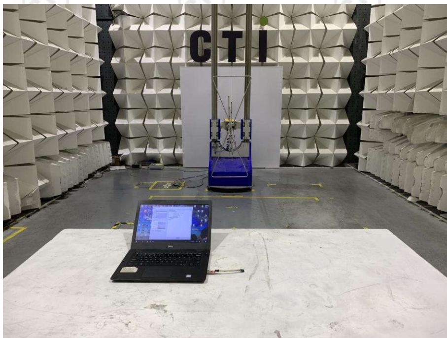
Radiated spurious emission Test Setup-1(Below 1GHz)