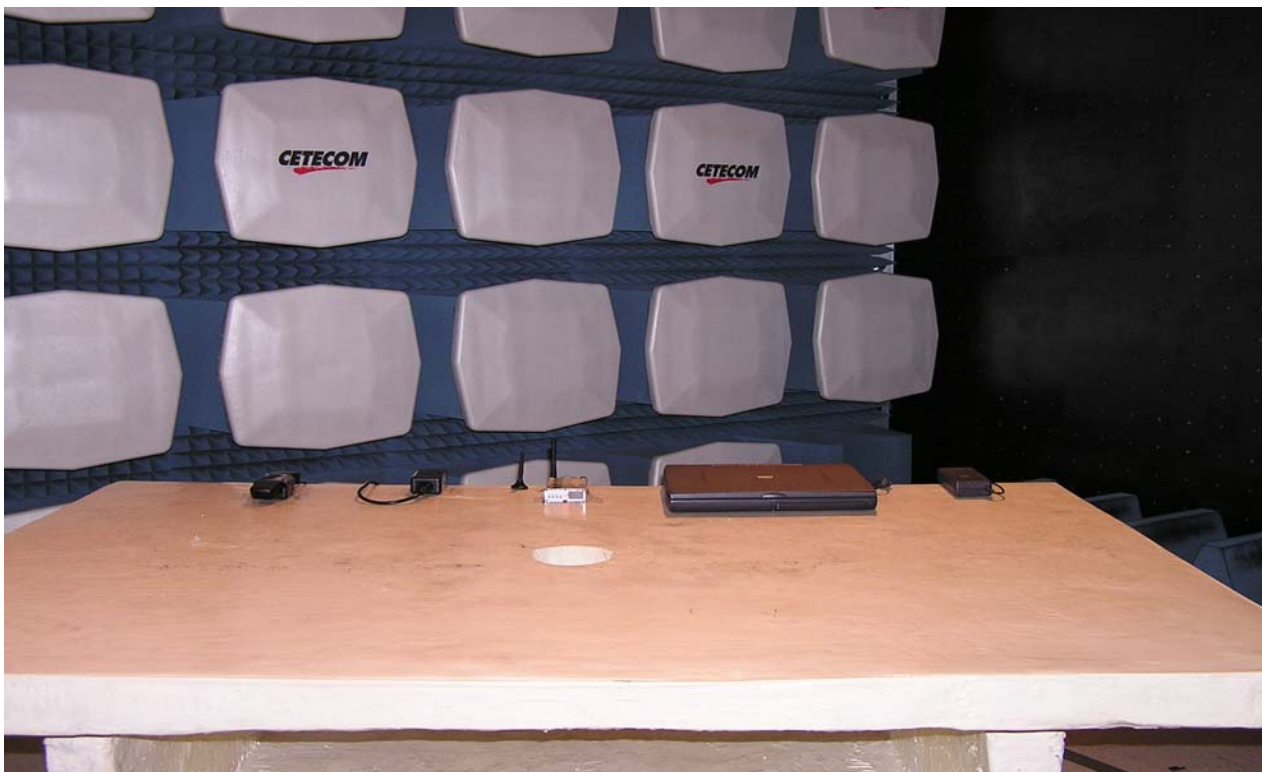
RADIATED EMISSIONS BELOW 1GHz (FRONT)