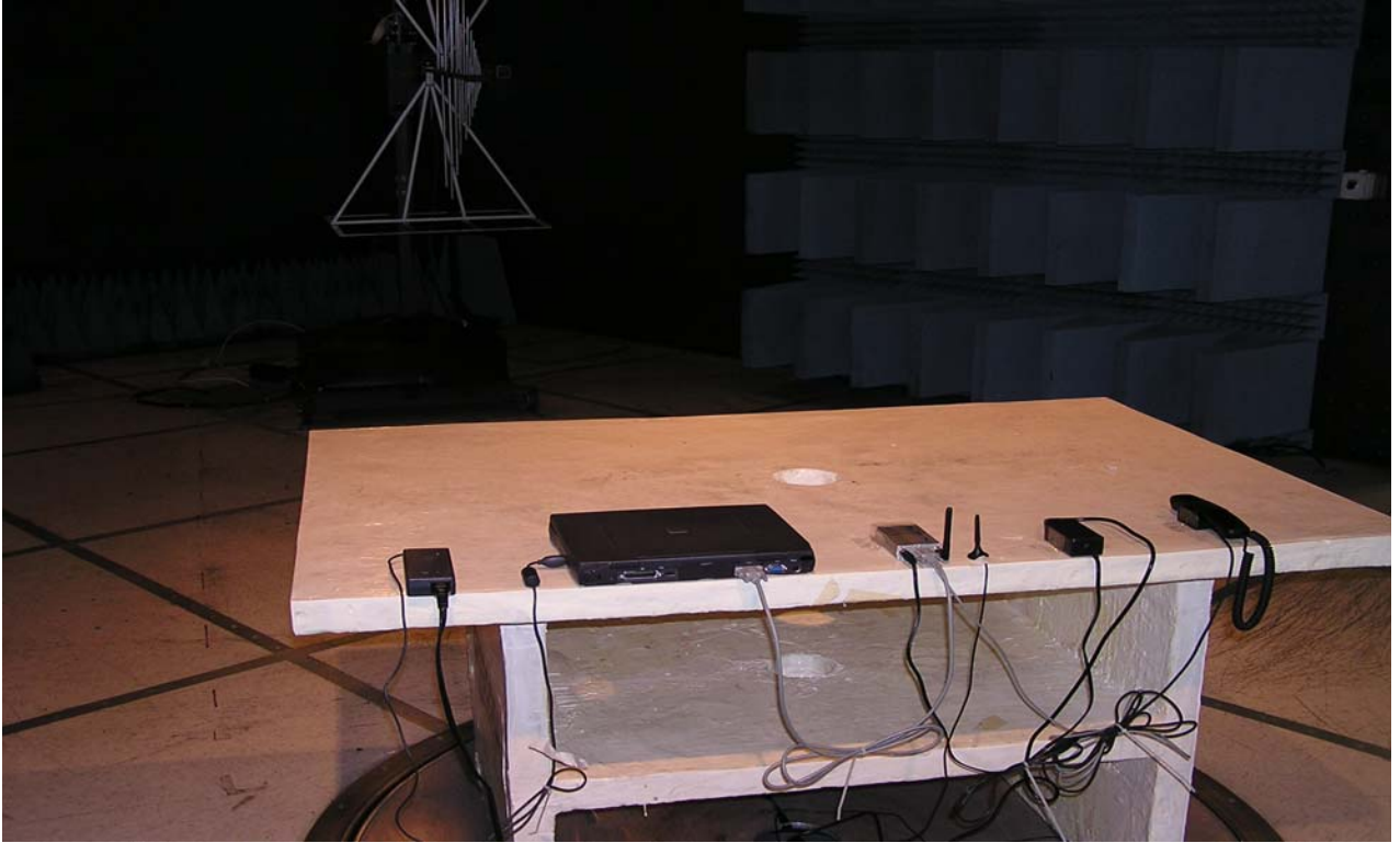
RADIATED EMISSIONS BELOW 1GHz (BACK)