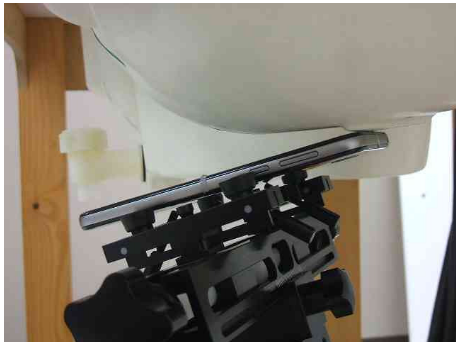
– Ear-Tilt Position –