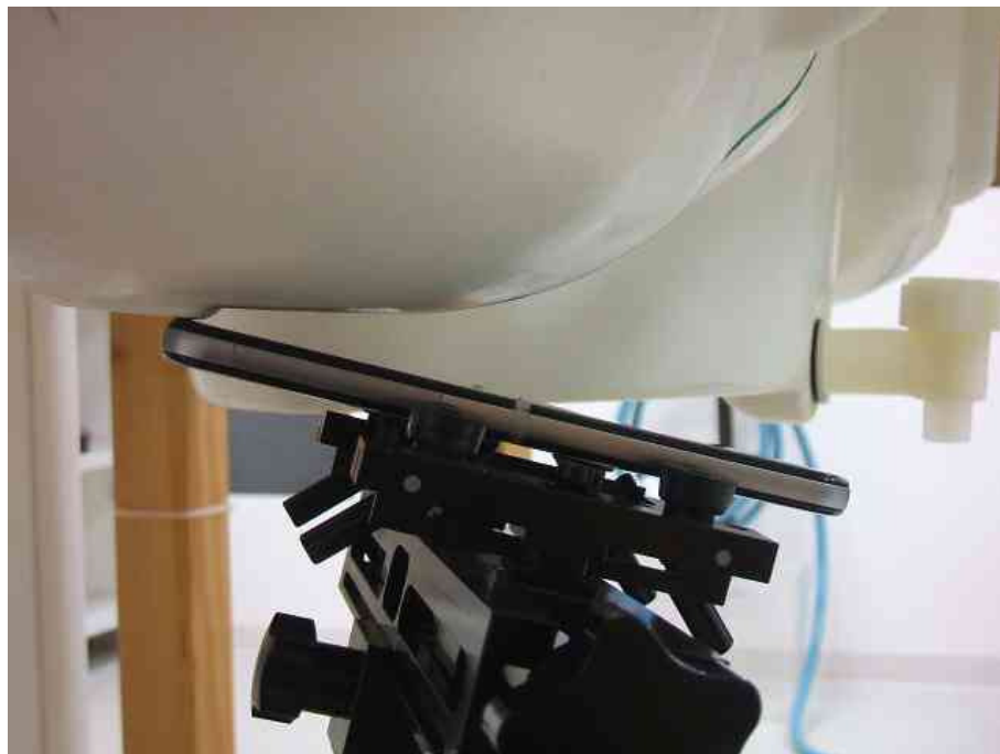
– Ear-Tilt Position –