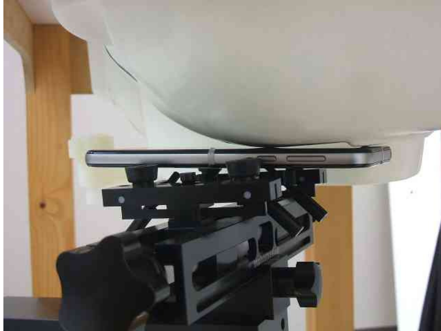
– Cheek-Touch Position –