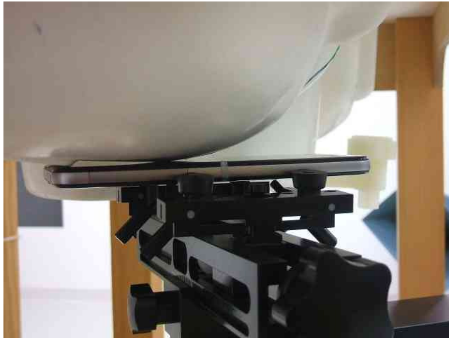
– Cheek-Touch Position –