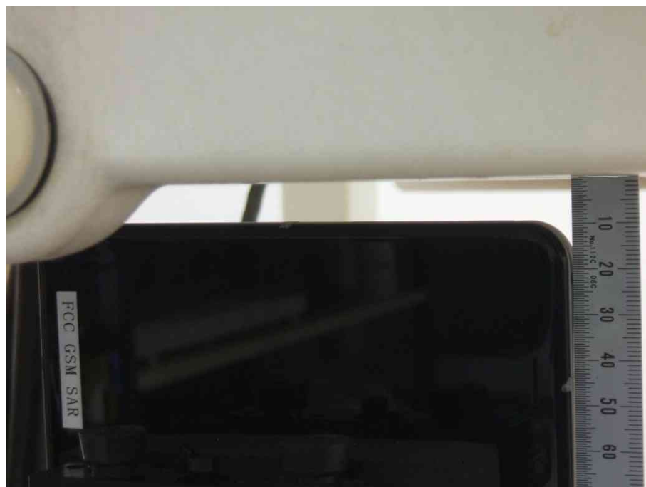
– Edge 4 (Left) –