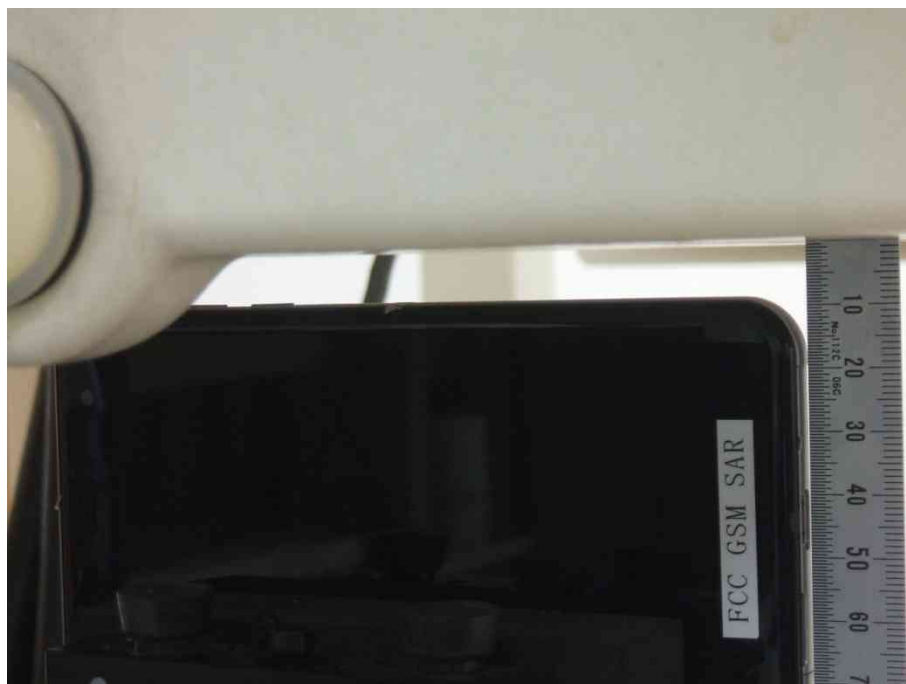
– Edge 2 (Right) –