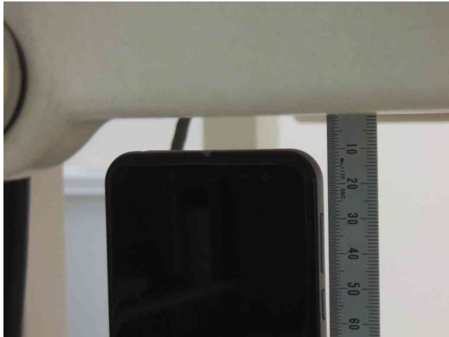
–Edge 1 (Top) –