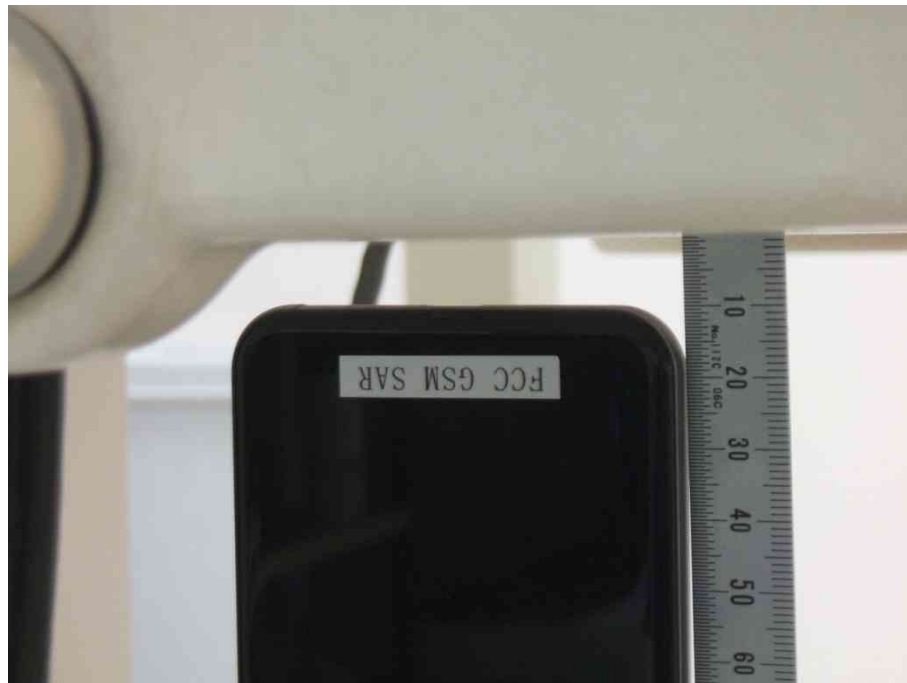
– Edge 3 (Bottom) –