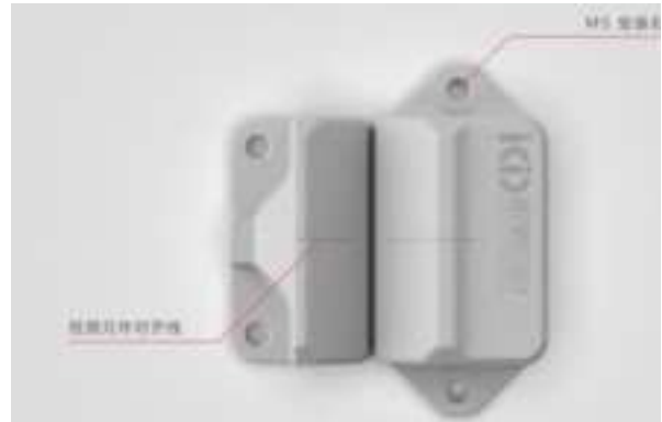
KP-CCXG700-DOOR Door Magnetic Sensor

KP-CCXG700-DOOR Wireless Door Magnetic Sensor can detect whether the container door is opened or closed during driving, thus improving security and operational efficiency. Door Magnetic Sensor can report the events on opening and closing, thus improving the asset security of the owners of containers.