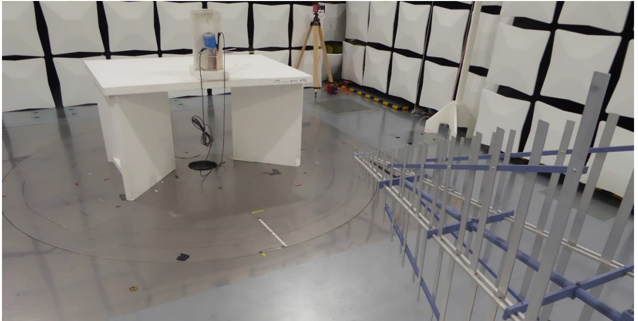
EUT nominal Position – standing Test setup semi-anechoic chamber M276 Preliminary and final measurement