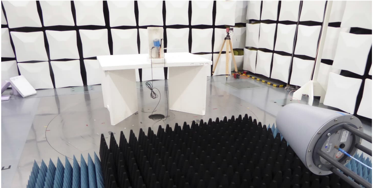
EUT nominal Position – standing Test setup semi-anechoic chamber with ground absorber M276 Preliminary and final measurement