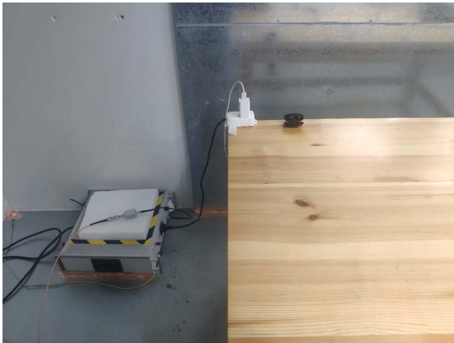
Test Photo 1