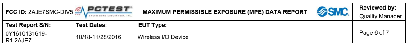
Table 1-6. Maximum Permissible Exposure Summary Table