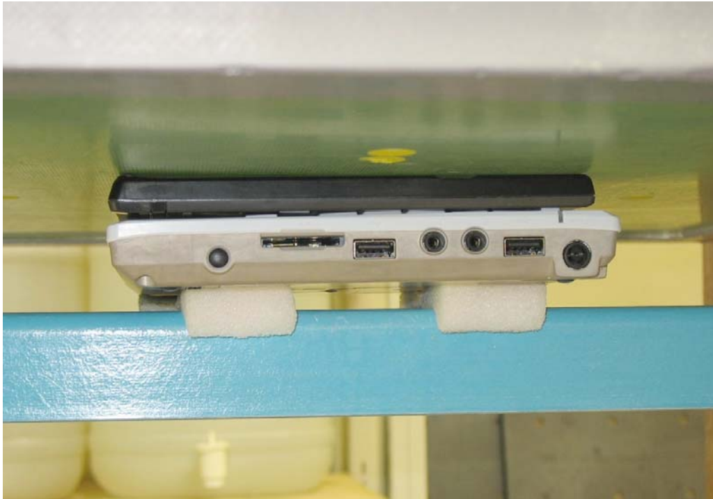
Arm Held Position