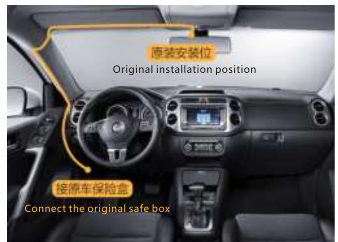
接线示意图 shows WIRING DIAGRAM