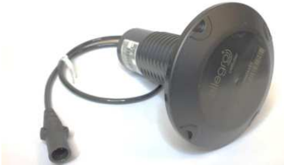
Figure 1 – Allegro Cellular PIT Module

The Allegro cellular PIT Module is a battery-operated radio module designed for automated water meter reading. The Allegro cellular is capable of reading water consumption data from residential and commercial water meters equipped with an Encoder or Solid-State Register. It uses CAT-M cellular radio for relaying water consumption data to the utility.