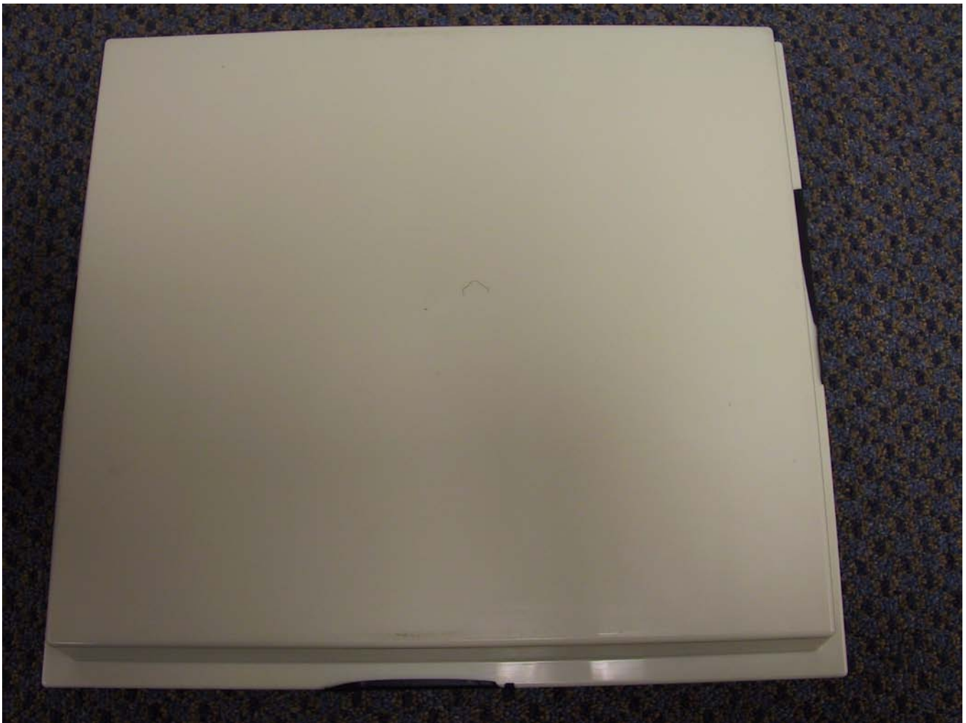
Figure 1 – External, front of unit – 19 dBi