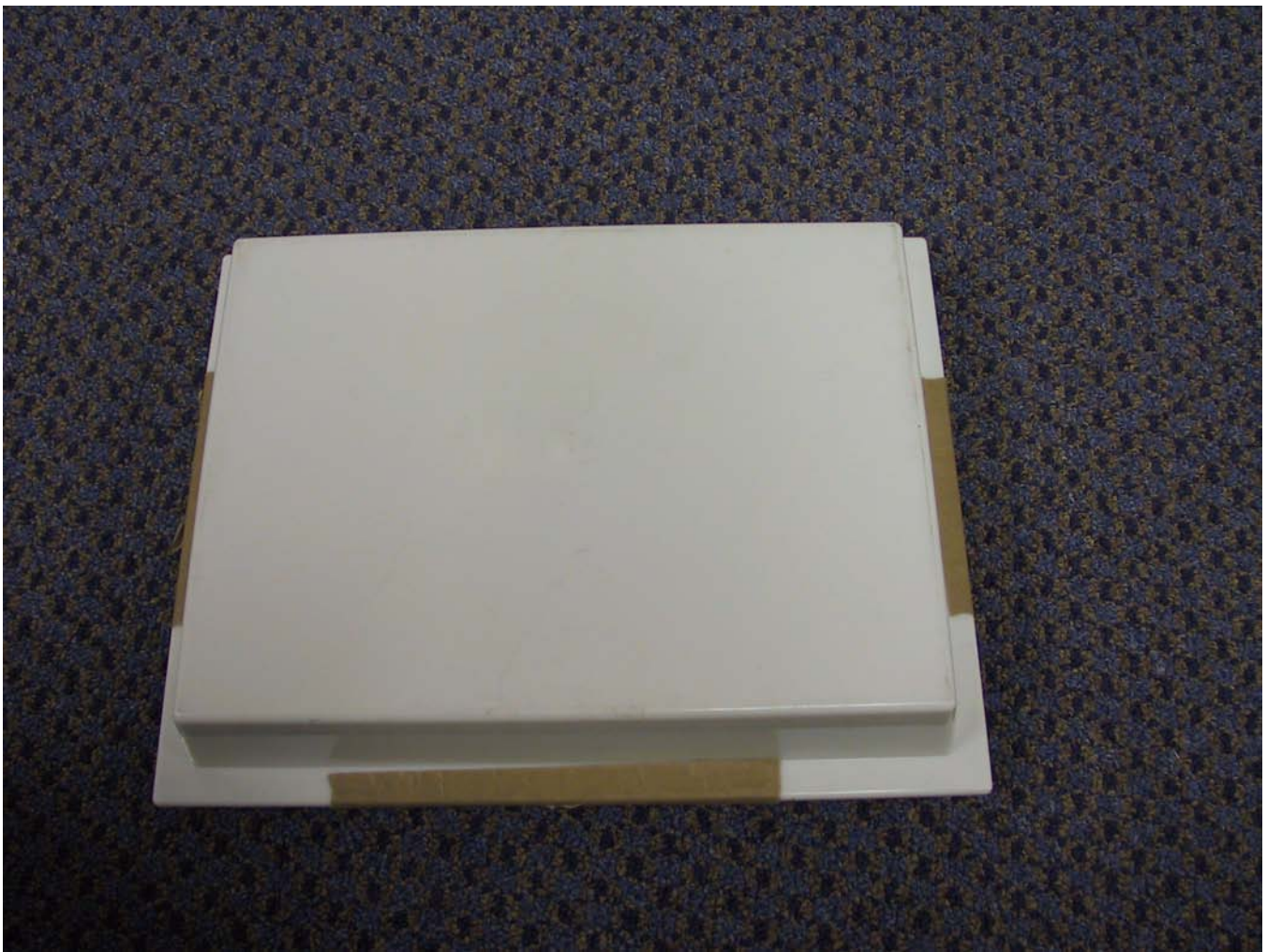
External front of unit, 15 dBi and N Connector