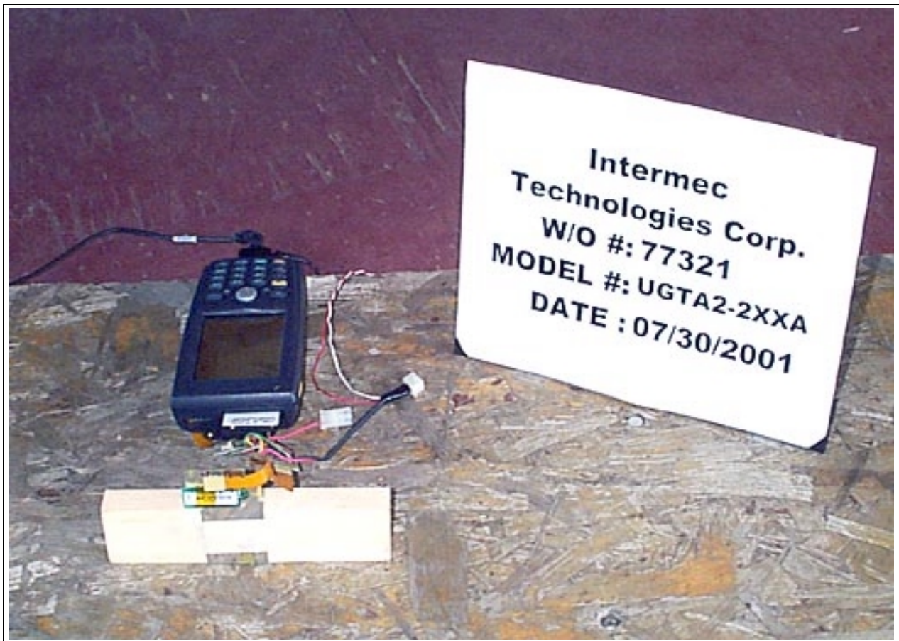
Radiated Emissions - Orthogonal C Front View Close up