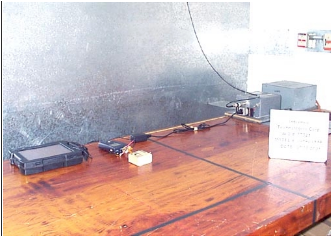
Mains Conducted Emissions - Front View