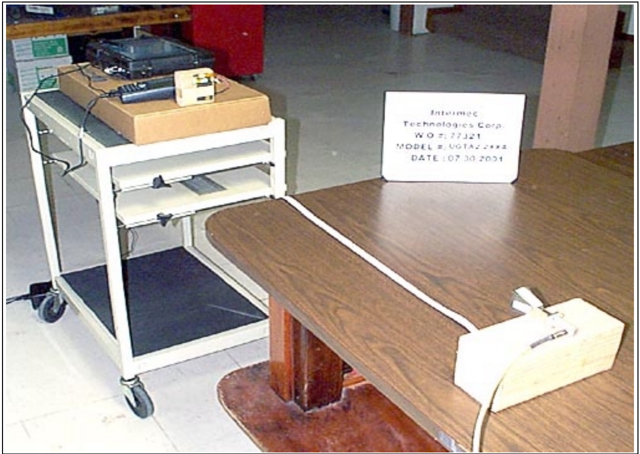
Radiated Emissions - 26GHz