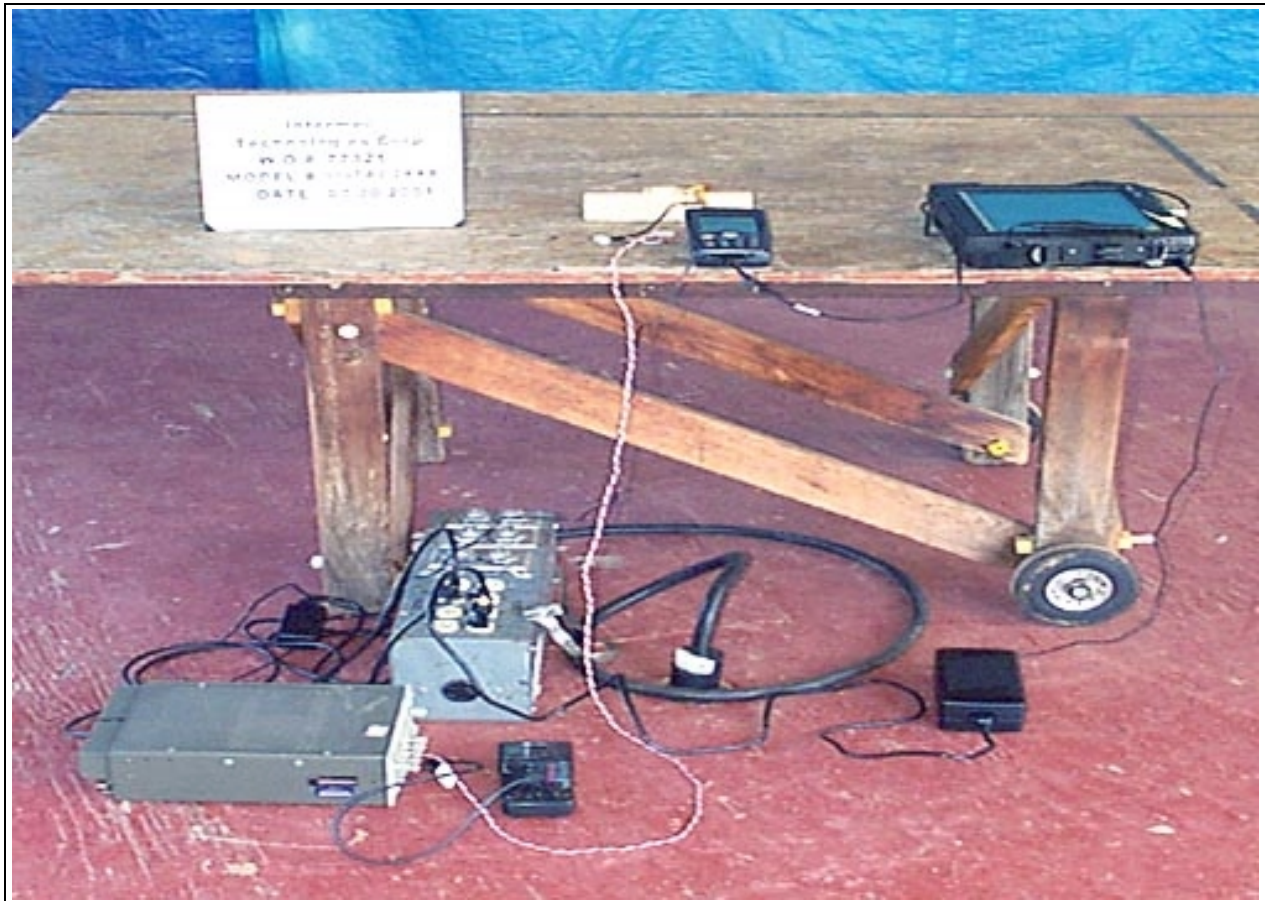
Radiated Emissions - Orthogonal B Back View