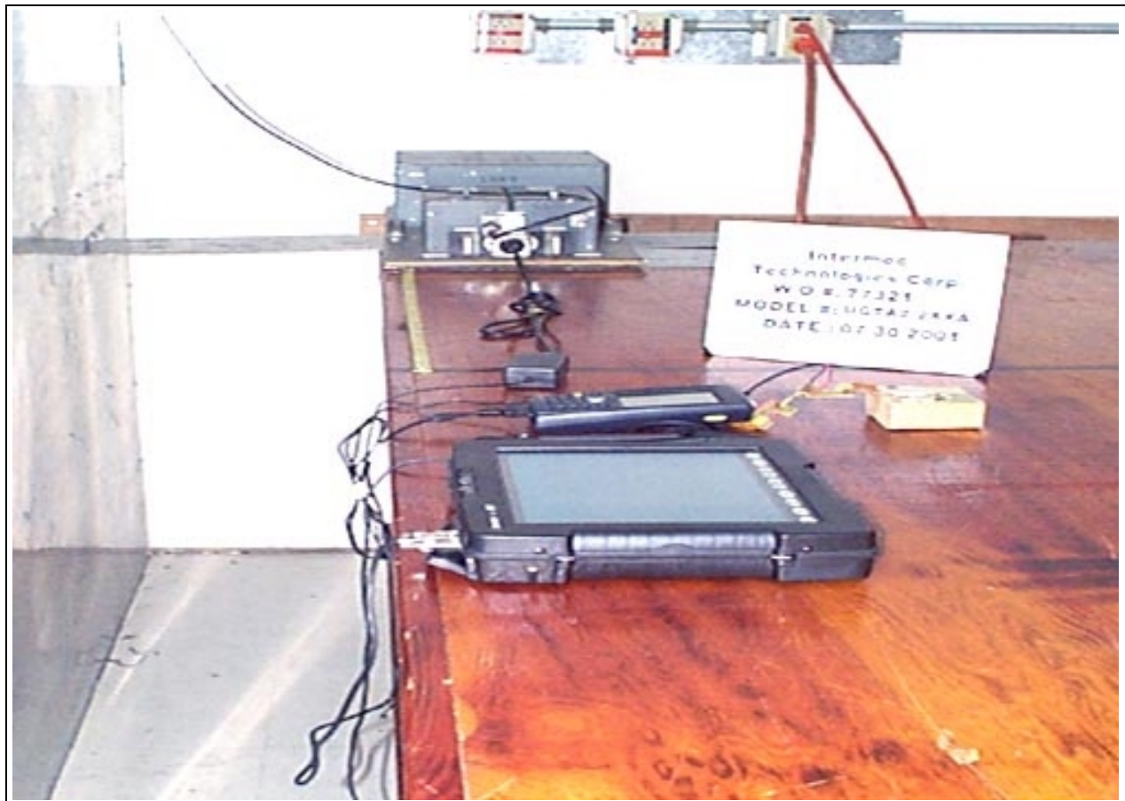
Mains Conducted Emissions - Side View