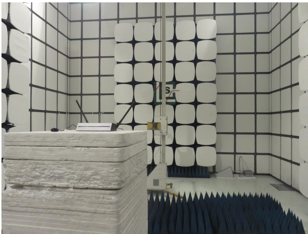
Radiated emission above 1GHz