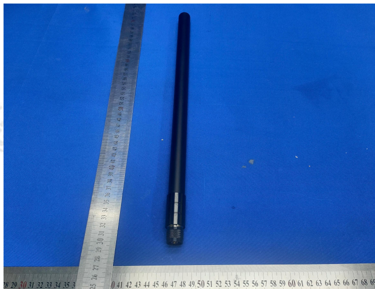
View of Product-27