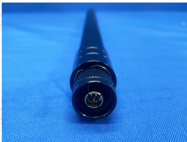
View of Product-26