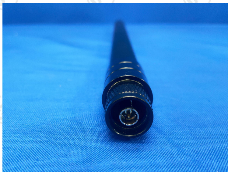
View of Product-28