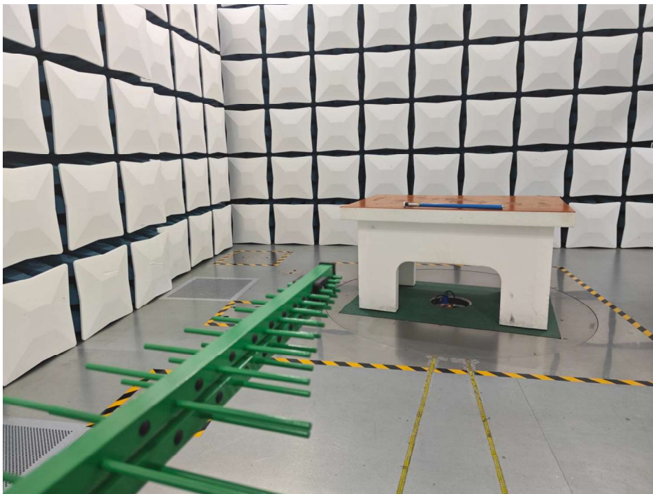
Test Set-up: Radiated spurious emission Below 1GHz