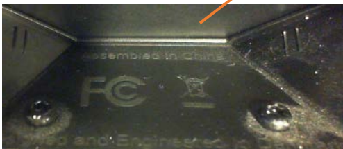
FCC and WEEE logos engraved on BS: