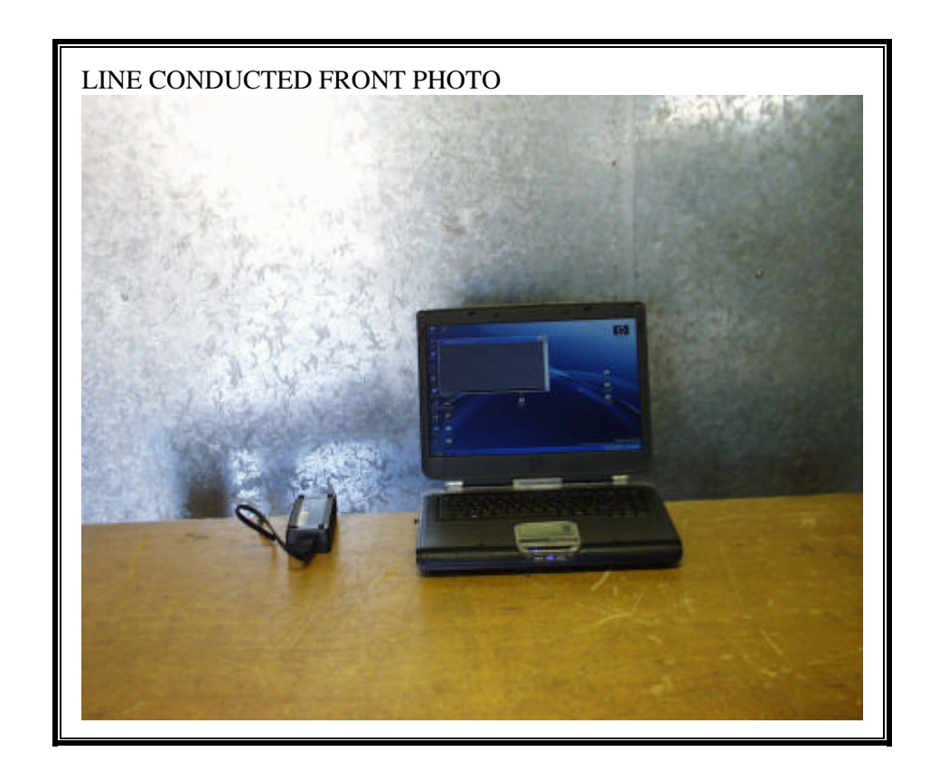
Page 41 of 42