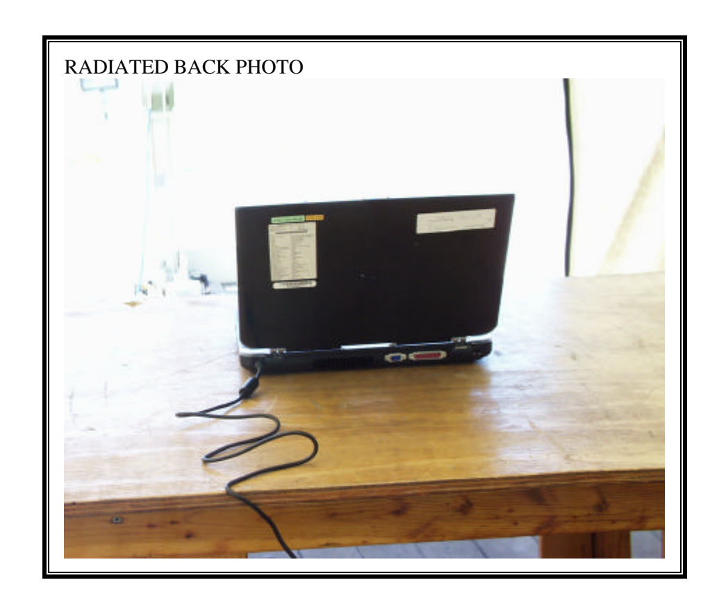
Page 40 of 42