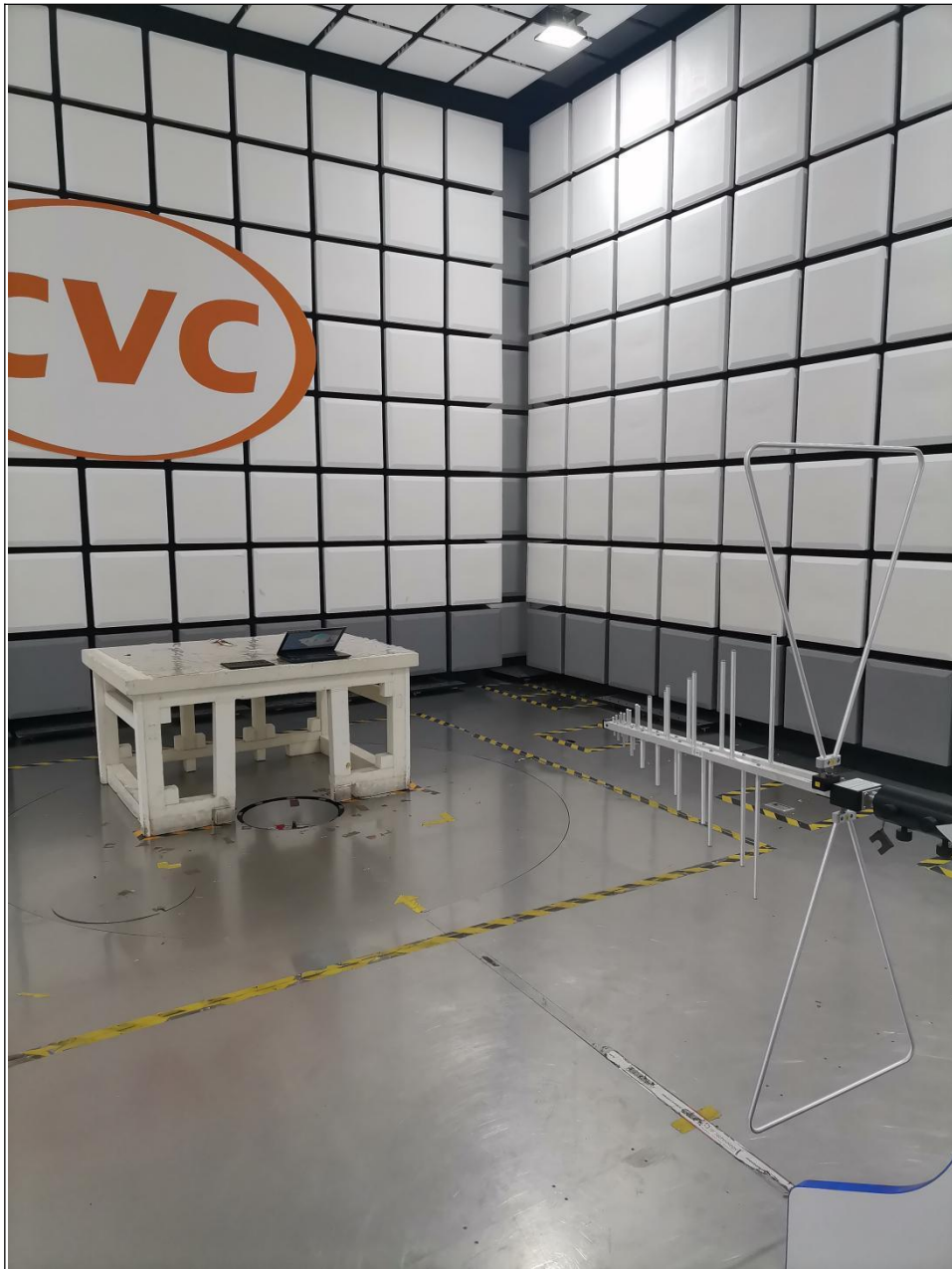
Frequency Range< Below 1GHz >