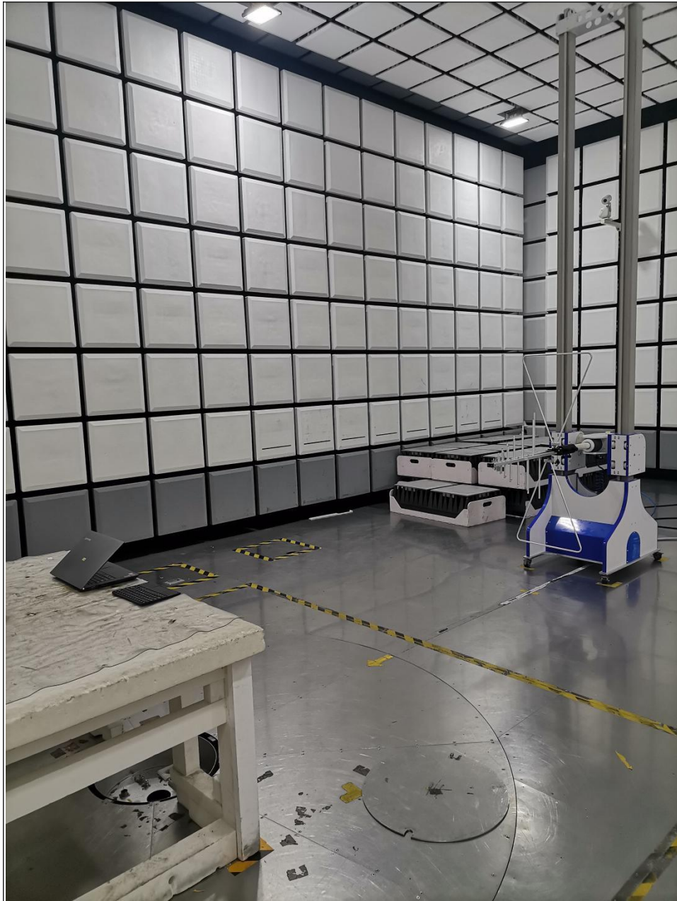
Frequency Range< Below 1GHz >