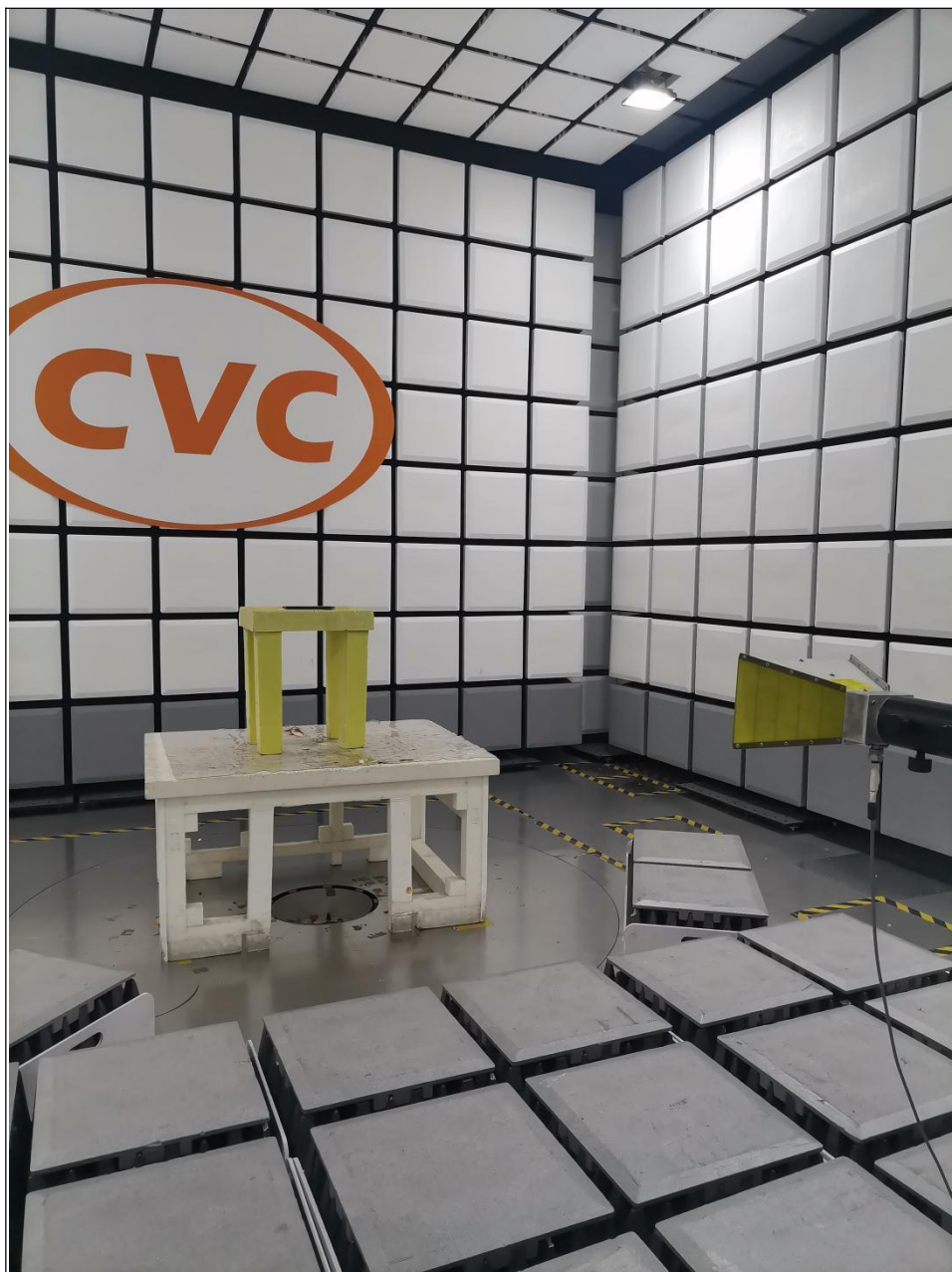
Frequency Range< Above 1GHz >