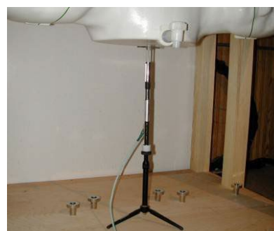
Figure A-2 System Verification Setup Photo