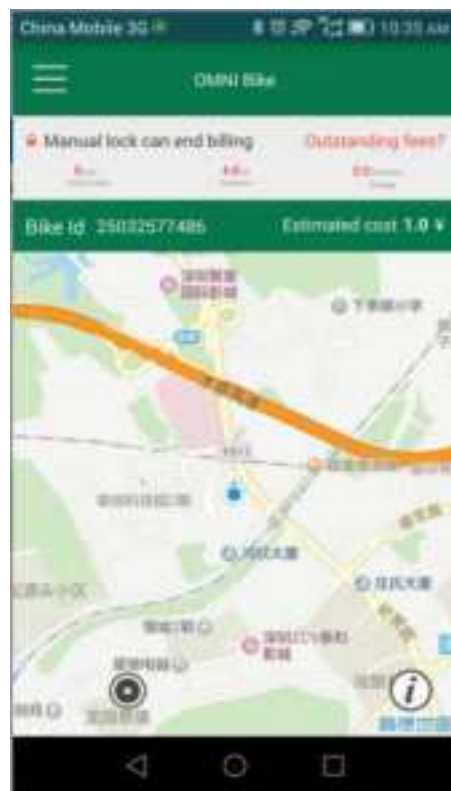
开锁用车页面 unlocking and using bike page