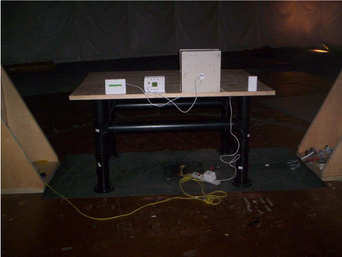
Radiated Emissions – Rear