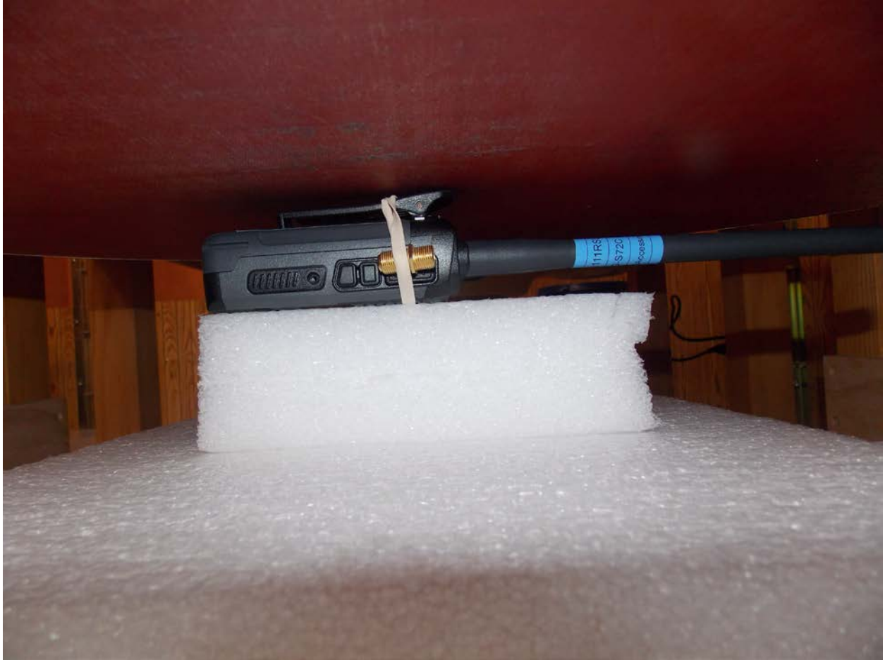
Body Test Position