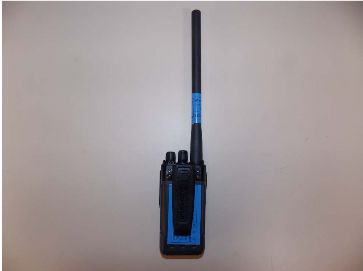
Back of Device