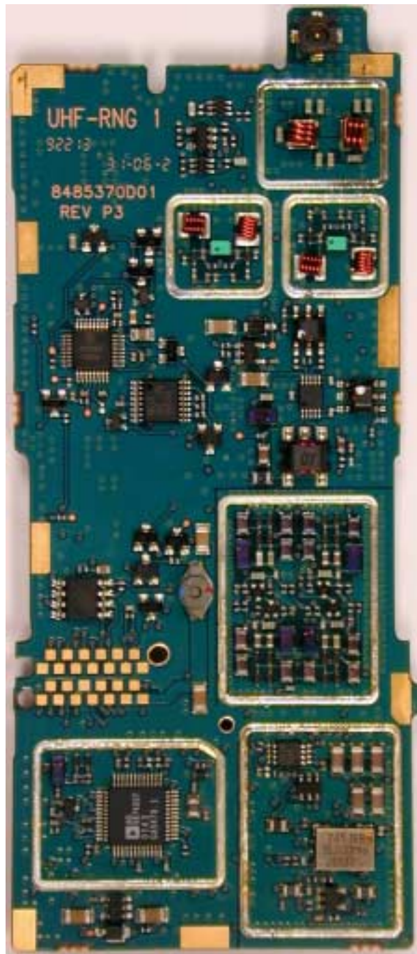
RF board without Shields (Top)