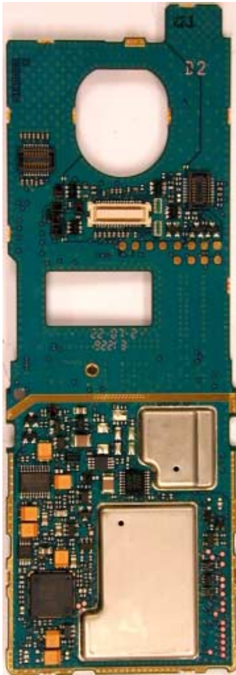
Vocon board with Shields (Top)