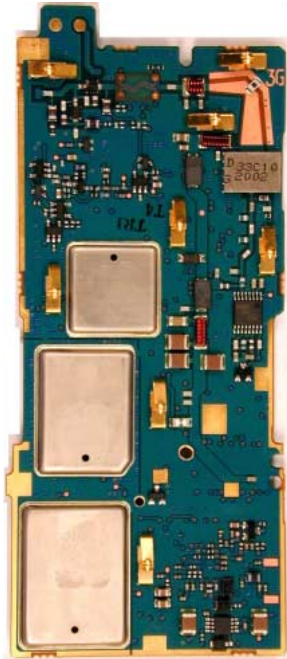
RF board with Shields (Bottom)