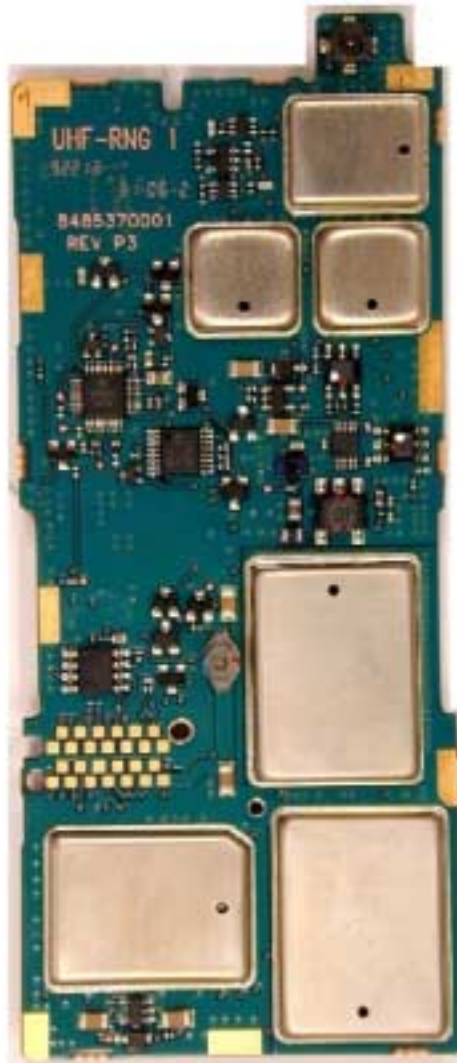
RF board with Shields (Top)