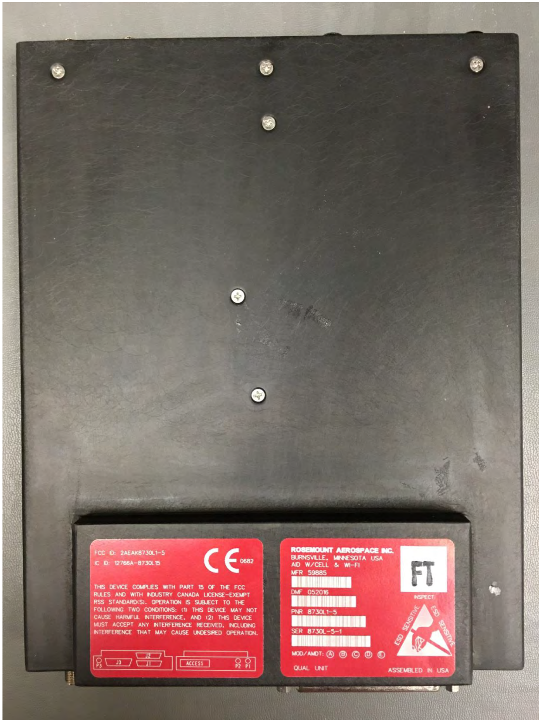
Figure 2: 8730L1-5 Top