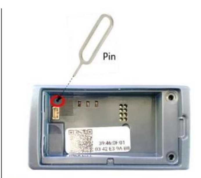
Note : Above is shown without battery for illustration purposes only.