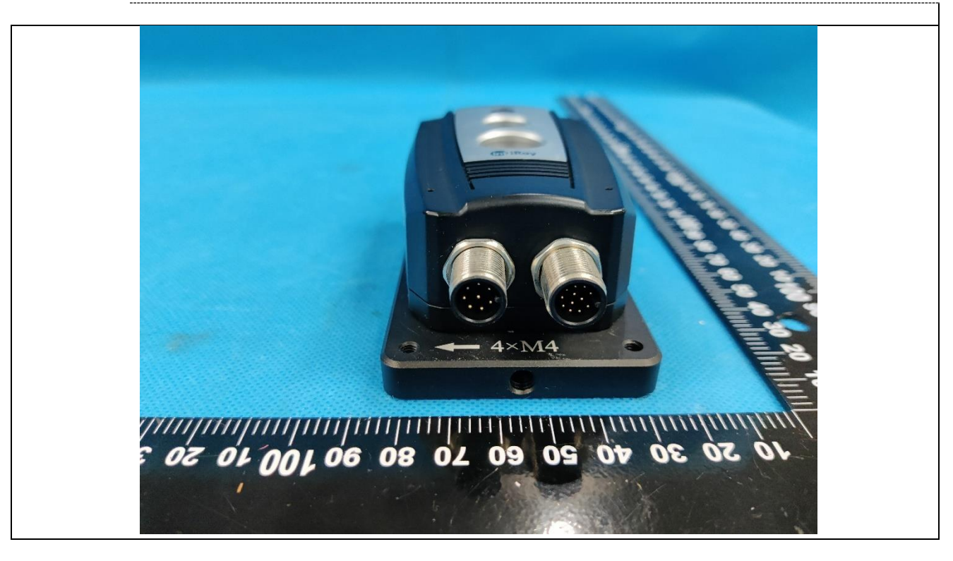
Details of: External view 3 of main unit