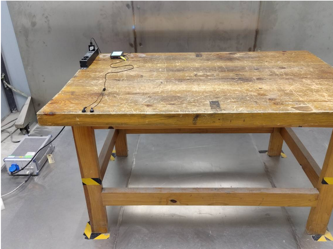
Conducted Emissions Side View Type-2 Adapter 1#