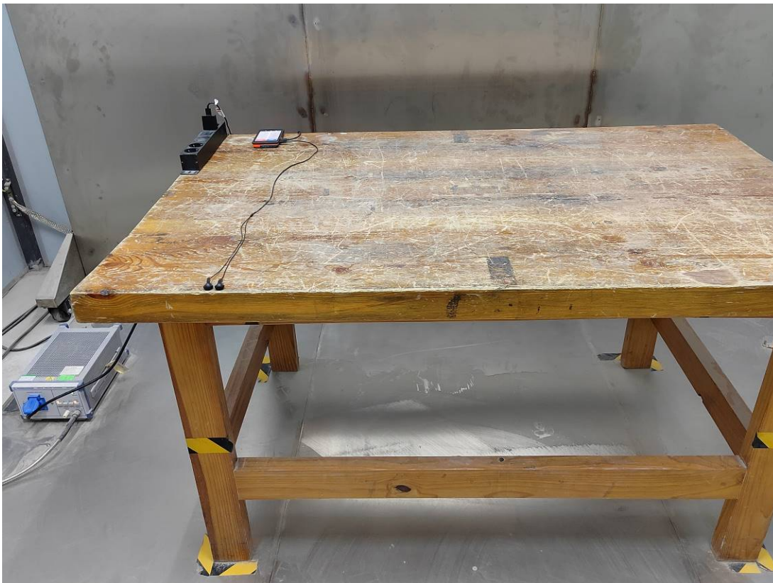
Conducted Emissions Side View Type-1 Adapter 1#