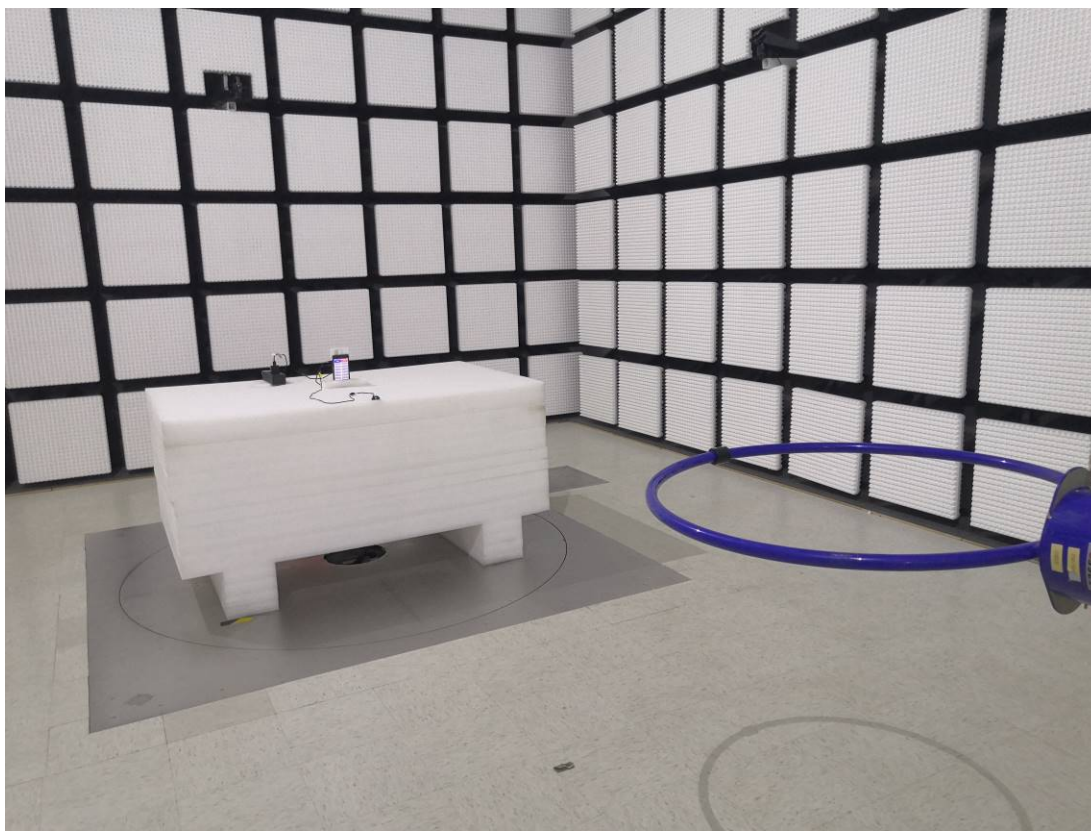
Radiated Emission 30MHz~1GHz View Type-2 Adapter 1#