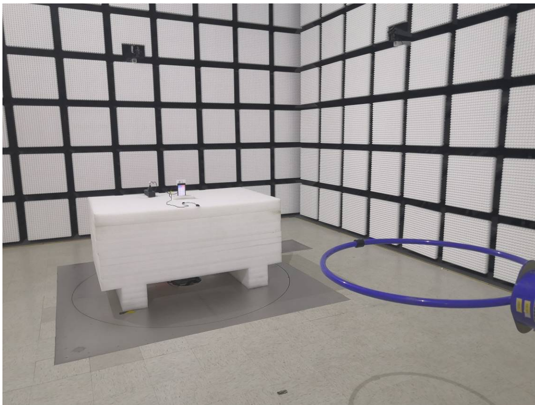
Radiated Emission 30MHz~1GHz View Type-1 Adapter 1#