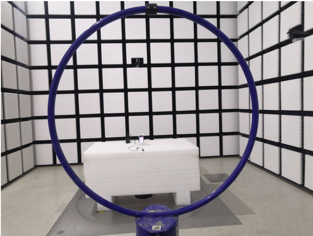
Radiated Emission 9kHz~30MHz Perpendicular View Type-1 Adapter 1#