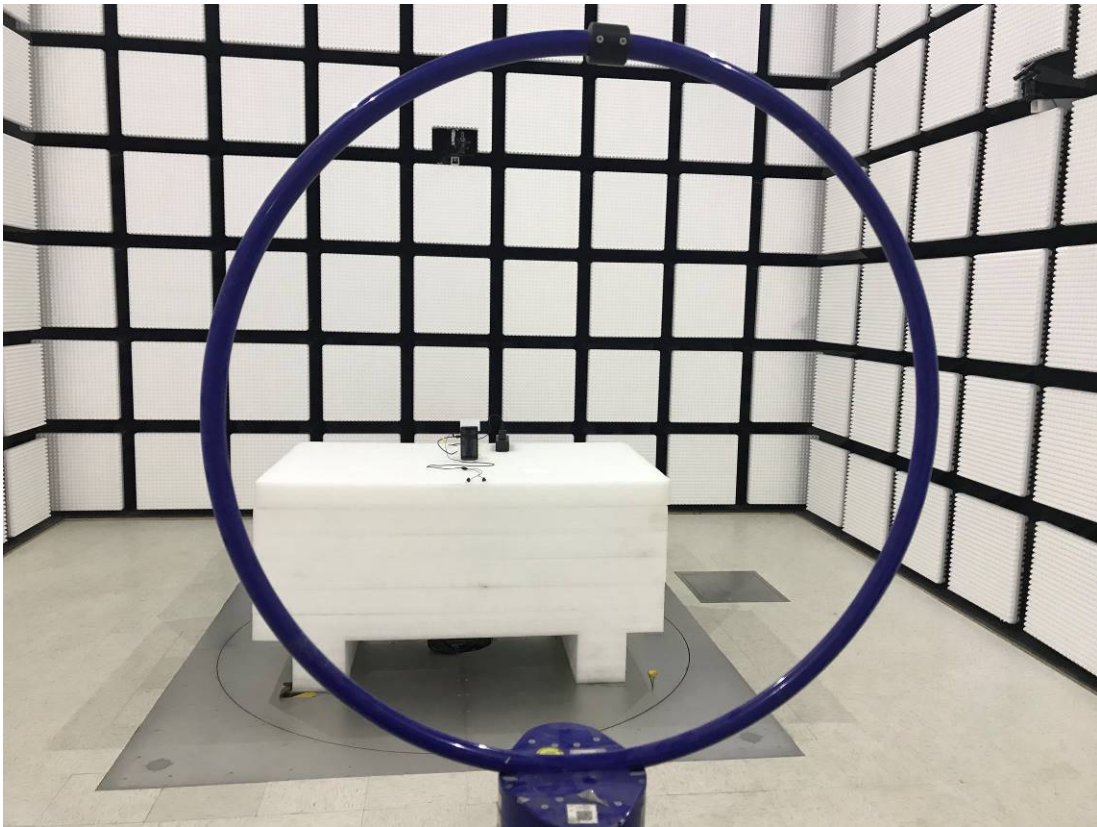
Radiated Emission 9kHz~30MHz Perpendicular View Type-2 Adapter 1#