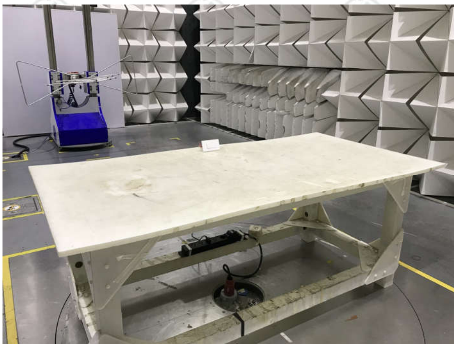
Radiated spurious emission Test Setup-2(Below 1GHz)