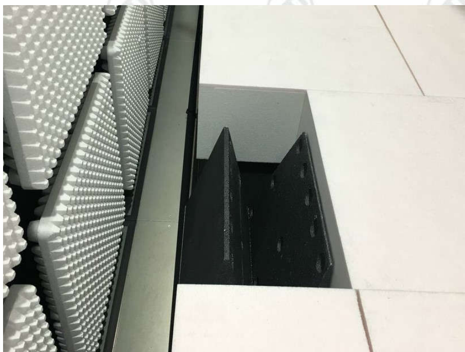
There are absorbing materials under the ground.