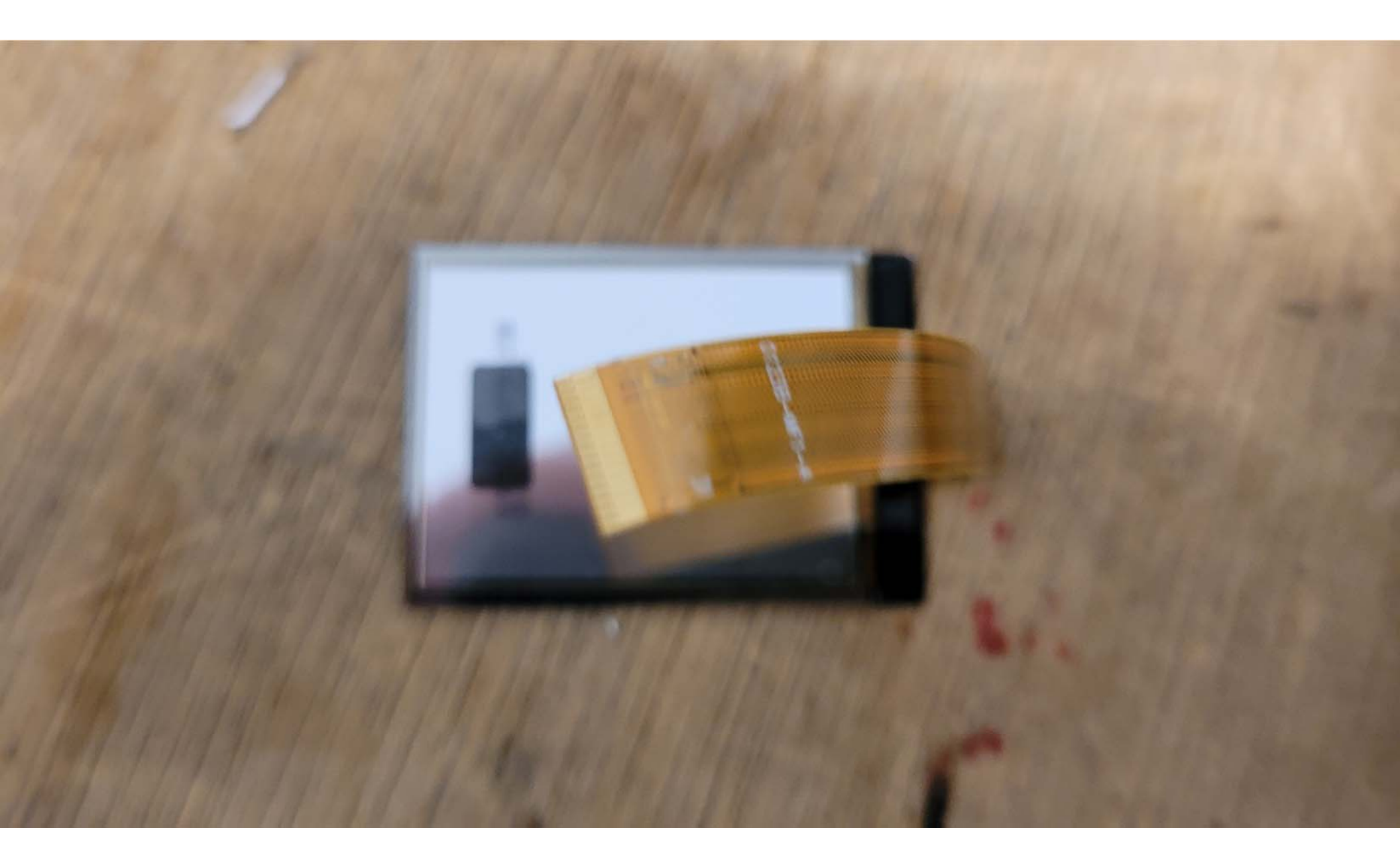
View of the Display Board - #1