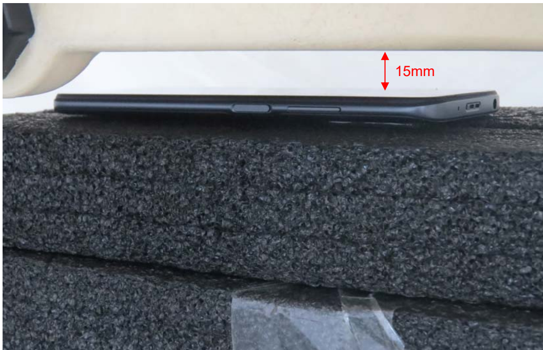
Picture 6: Front Side, the distance from handset to the bottom of the Phantom is 15mm