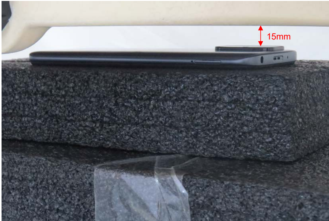
Picture 5: Back Side, the distance from handset to the bottom of the Phantom is 15mm