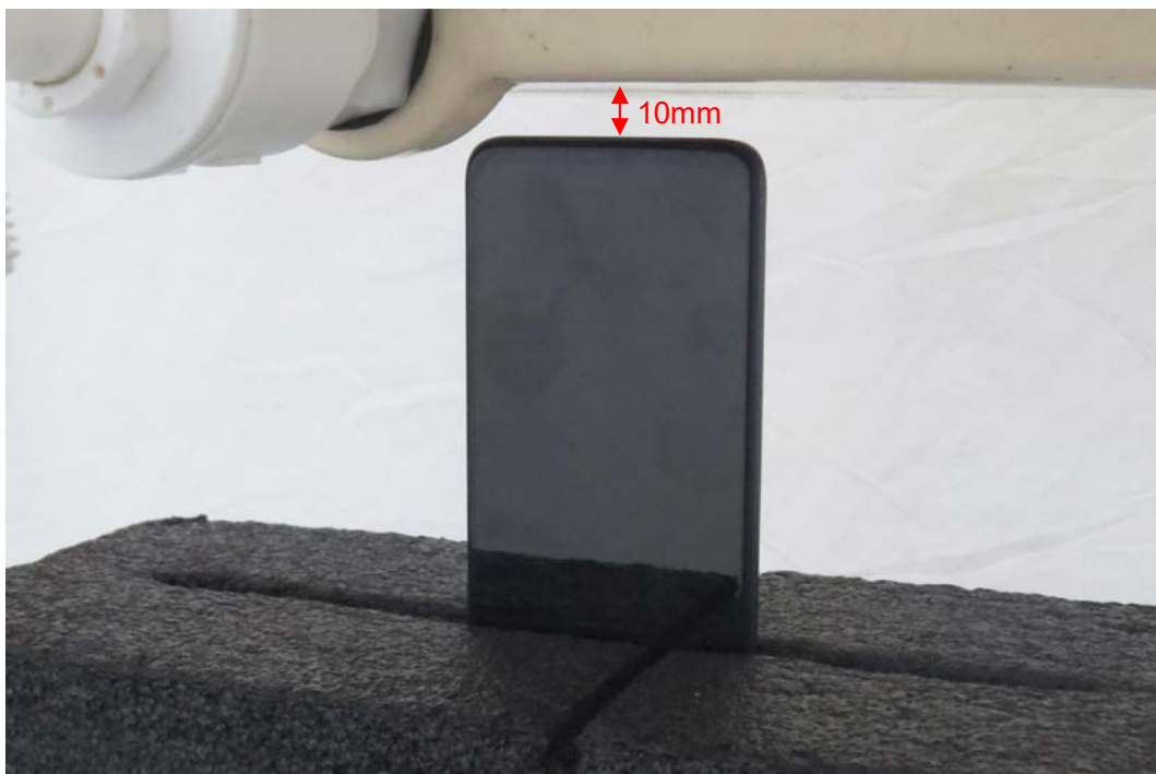
Picture 14: Bottom Edge, the distance from handset to the bottom of the Phantom is 10mm