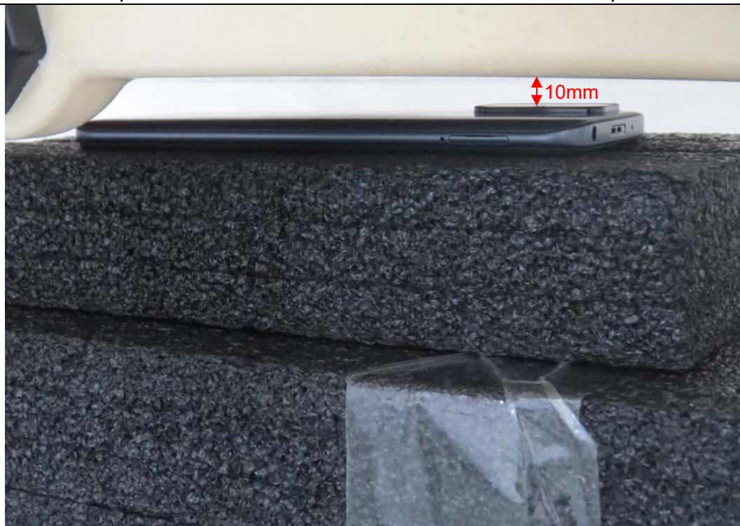
Picture 9: Back Side, the distance from handset to the bottom of the Phantom is 10mm