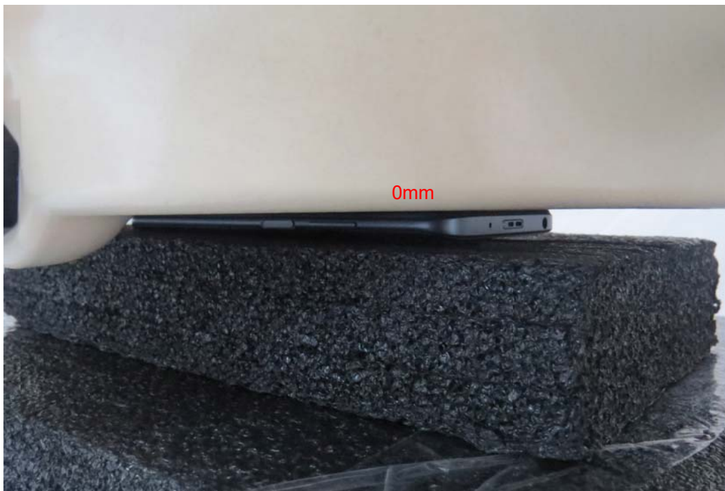
Picture 16: Front Side, the distance from handset to the bottom of the Phantom is 0mm