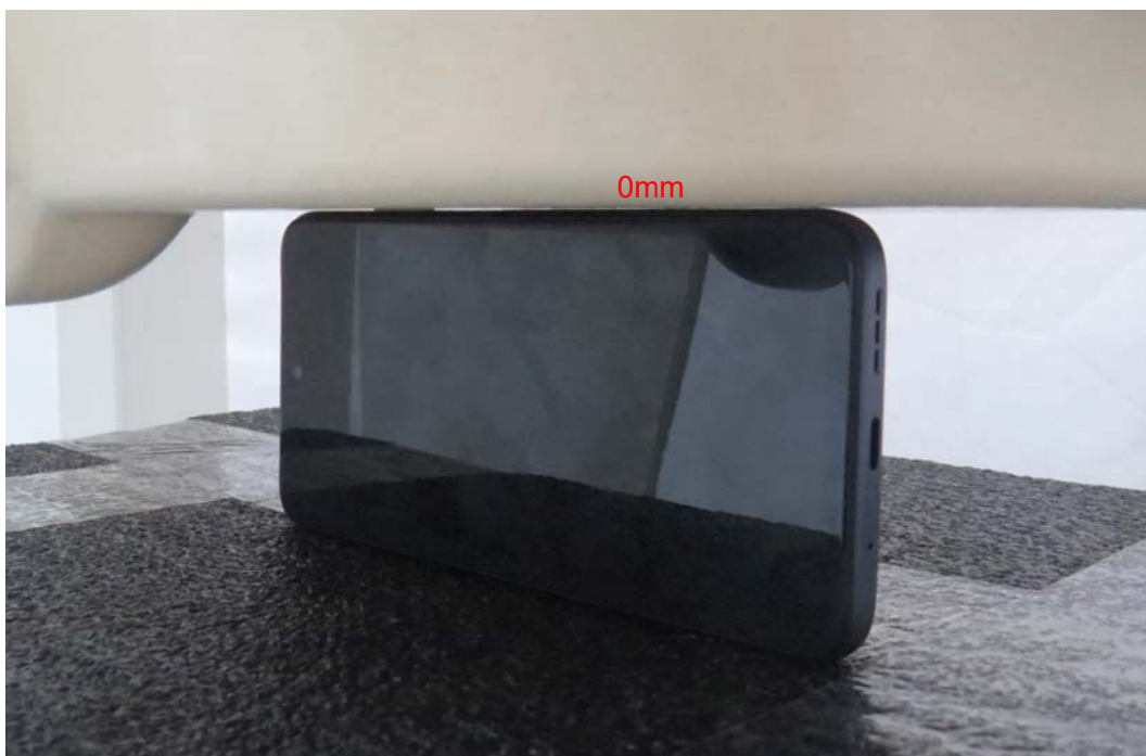
Picture 18: Right Edge, the distance from handset to the bottom of the Phantom is 0mm