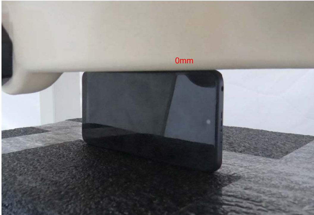
Picture 17: Left Edge, the distance from handset to the bottom of the Phantom is 0mm