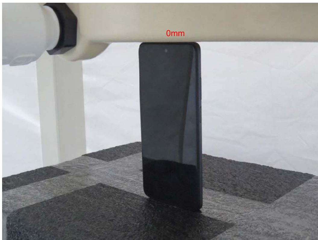
Picture 19: Top Edge, the distance from handset to the bottom of the Phantom is 0mm