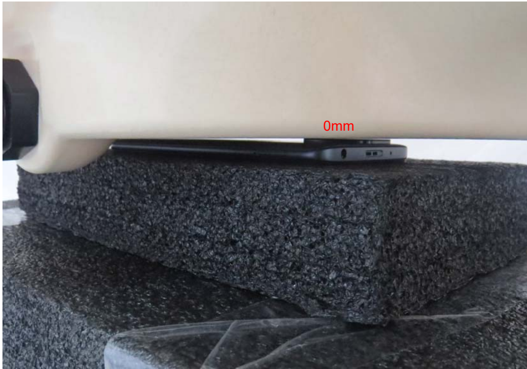
Picture 15: Back Side, the distance from handset to the bottom of the Phantom is 0mm