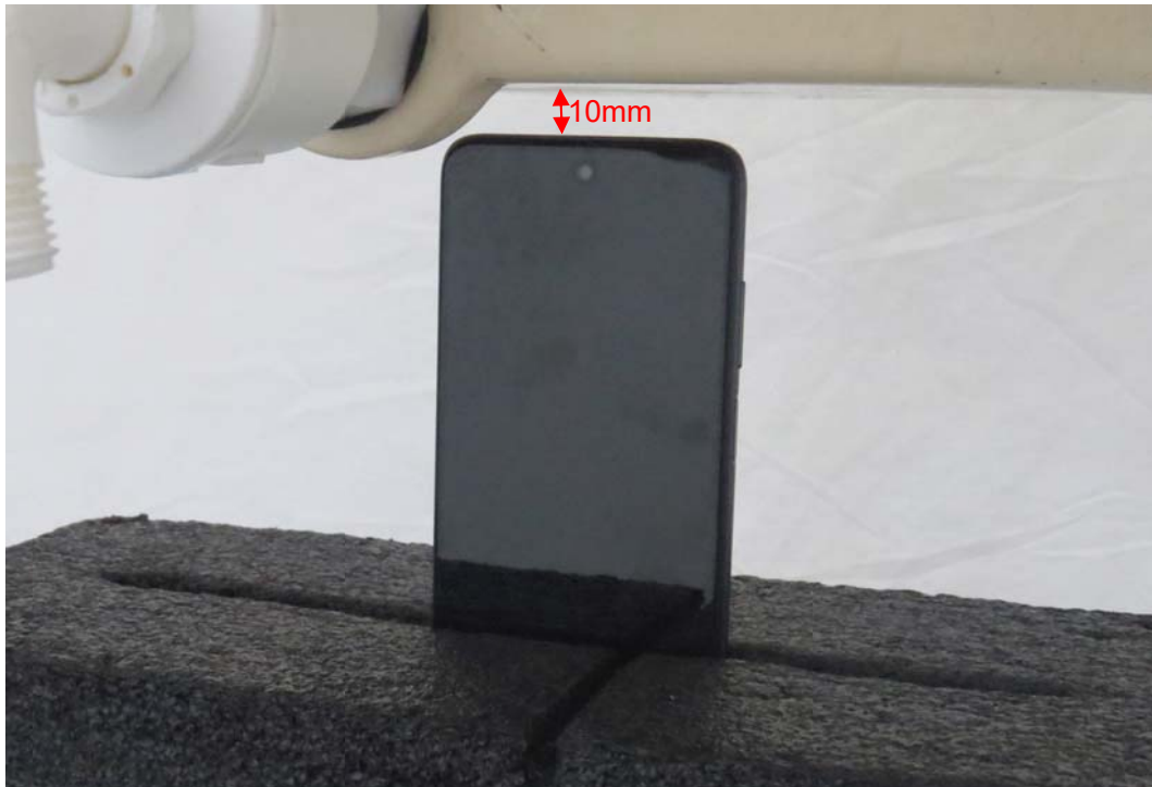
Picture 13: Top Edge, the distance from handset to the bottom of the Phantom is 10mm