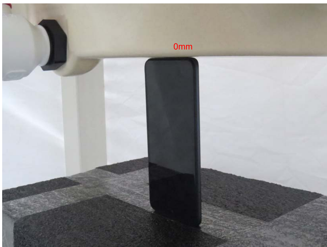
Picture 20: Bottom Edge, the distance from handset to the bottom of the Phantom is 0mm