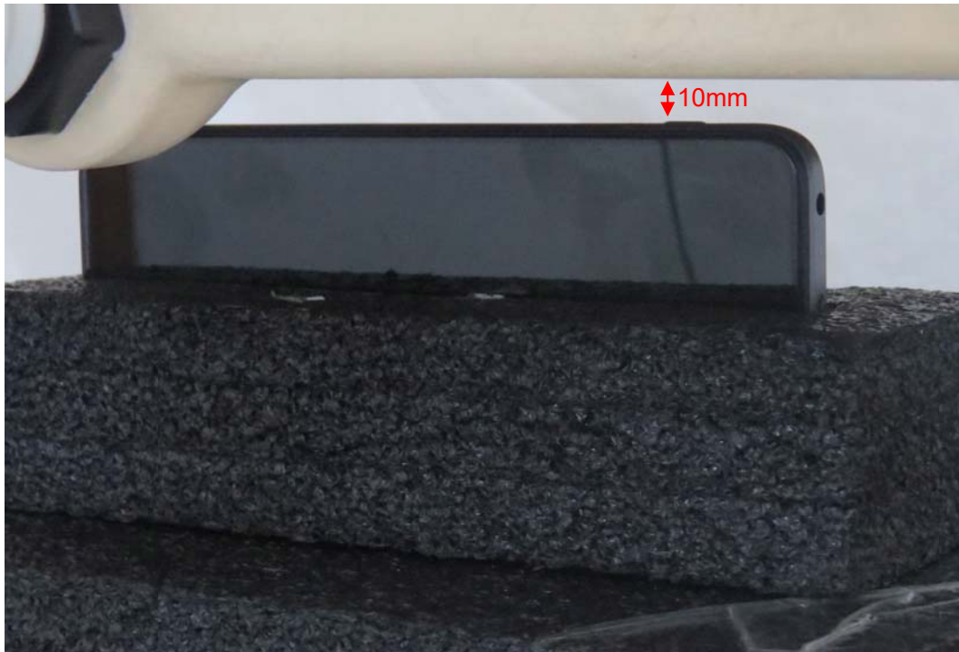
Picture 11: Left Edge, the distance from handset to the bottom of the Phantom is 10mm