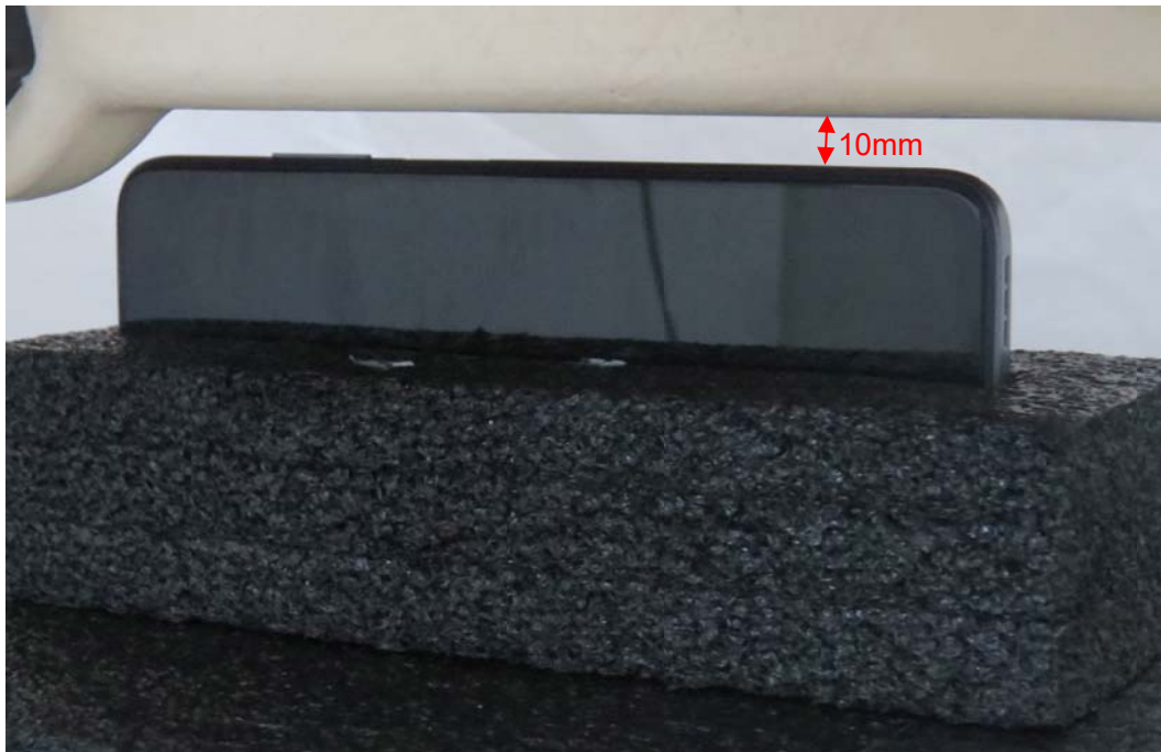
Picture 12: Right Edge, the distance from handset to the bottom of the Phantom is 10mm