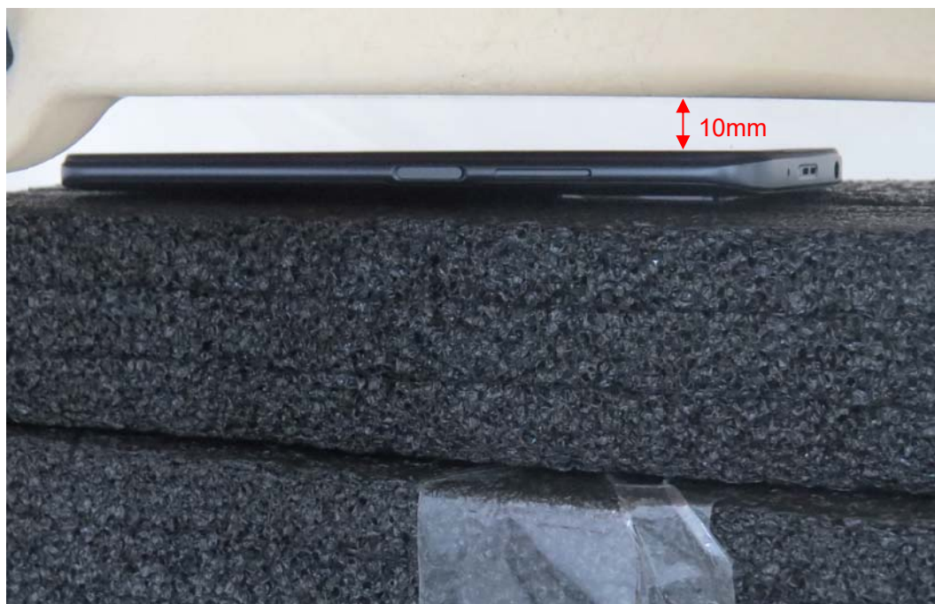
Picture 10: Front Side, the distance from handset to the bottom of the Phantom is 10mm