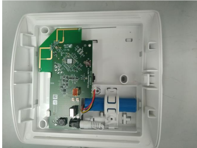
Photograph No.1 Wireless Repeater for PowerG Communications Internal view